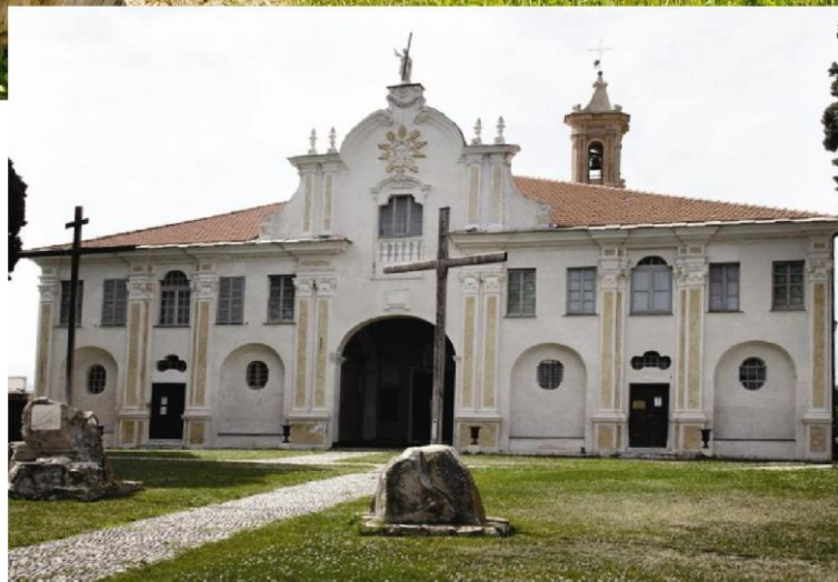
In alto: panorama di Imperia dal colle del Calvario, con i due centri di Porto Maurizio e Oneglia (in lontananza) Santuario di Santa Croce al Calvario - Fine sec. XVI-inizio XVIII