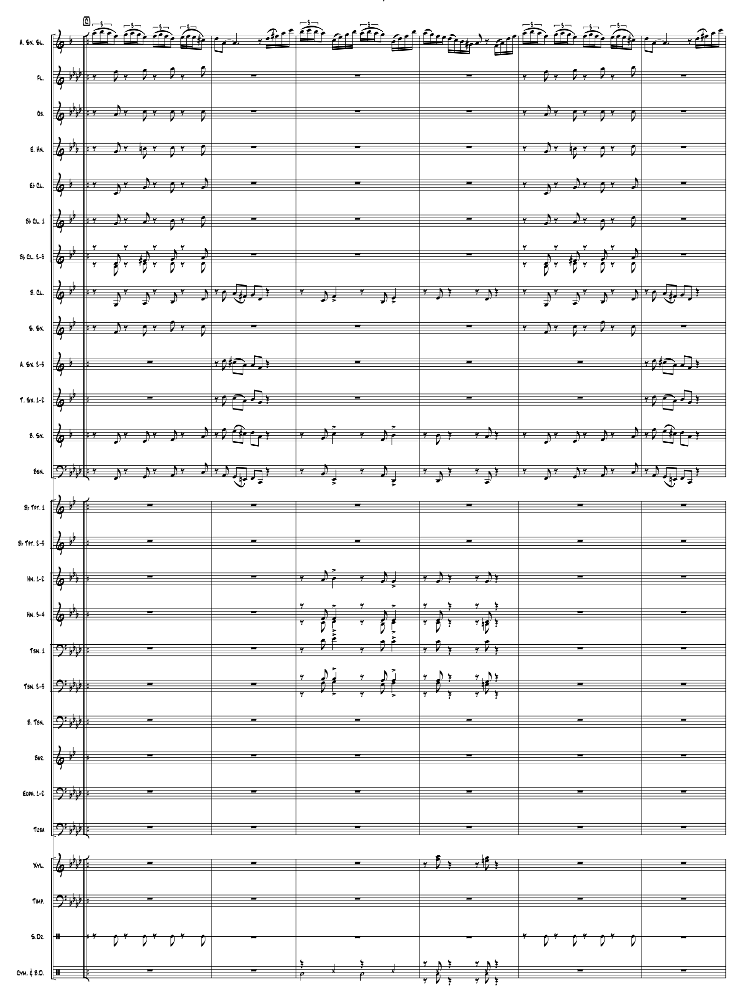
ESSELUNGA - ILIO VOLANTE