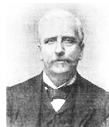
Th. Salomé (1834-1896)

Récit.: Flûte traversière, Bourdon et Gambe de 8' Positif: Salicional et Fl. harm. del 8' Flûte douce de 4' (Clarinette préparée.) Gd.Orgue: Flûte, Bourdon, Gambe et Montre de 8' Pédale: Fonds de 16' et 8'