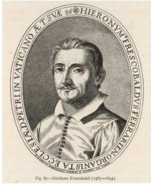
Fig. 87.—Girolamo Frescobaldi (1583—1643).