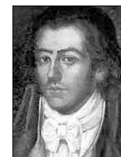
Louis-Claude Daquin 1694-1772