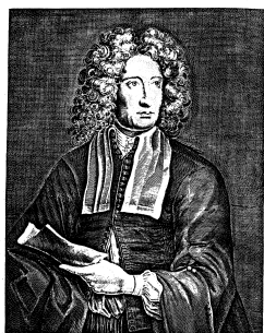
ARCANGELO CORELLI 1653-1713