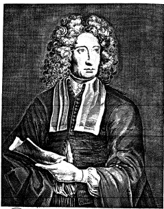
ARCANGELO CORELLI 1653-1713