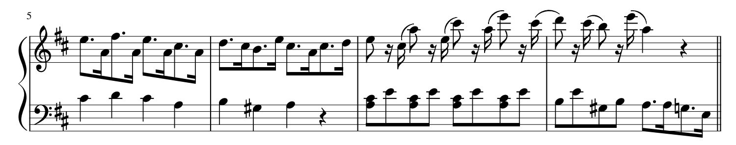
Var. 6 D.C. al Fine