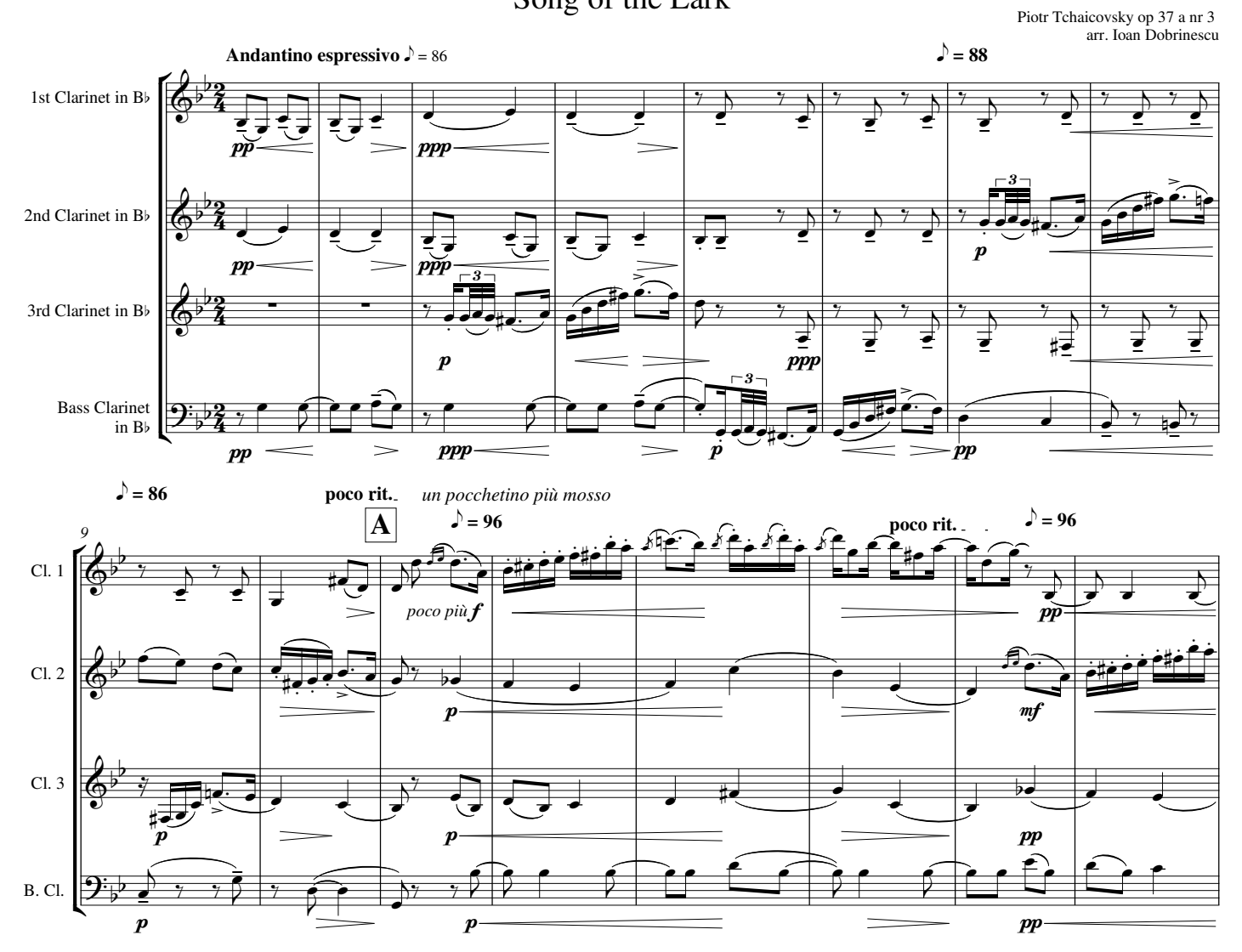
March Song of the Lark