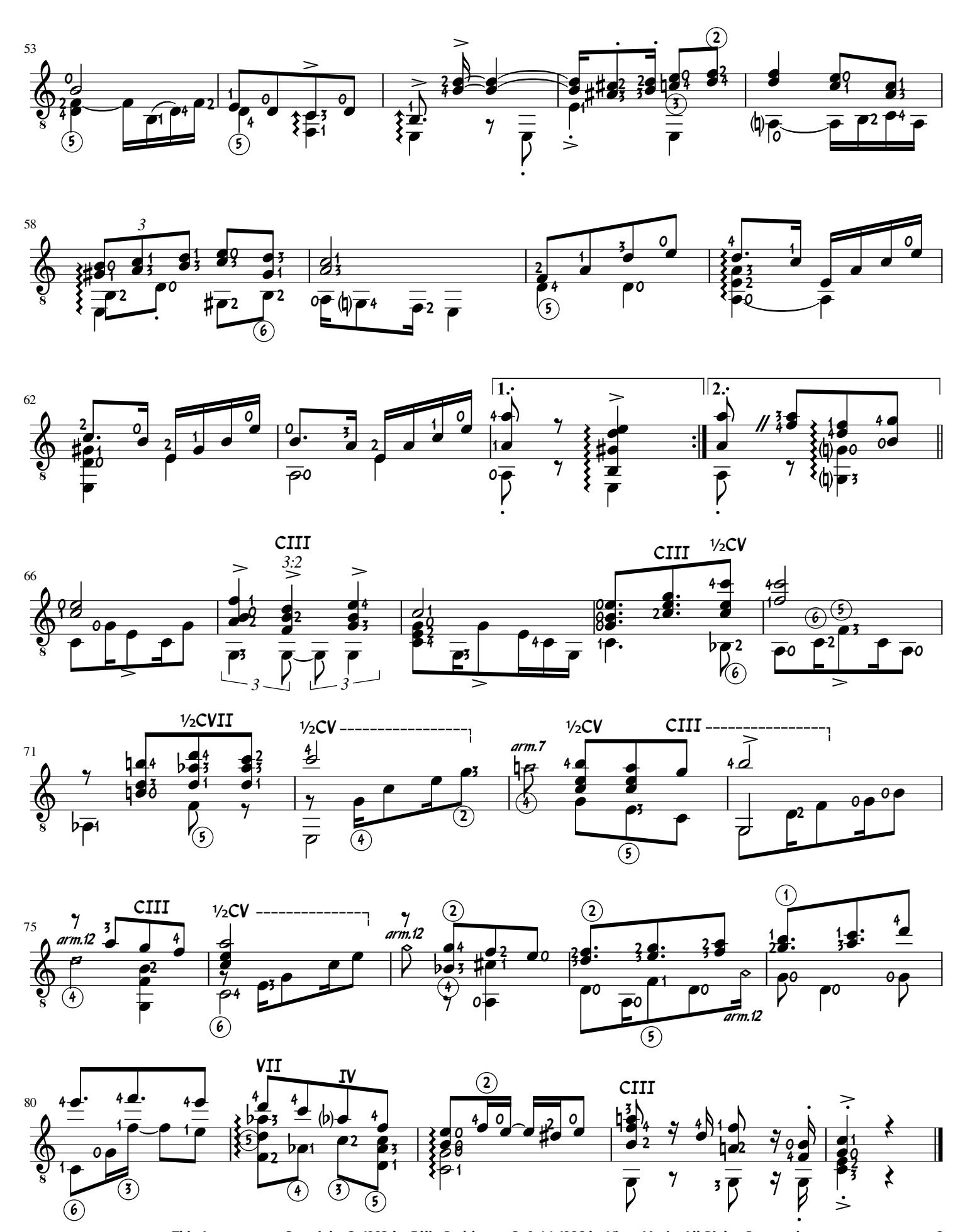
This Arrangement Copyright © 1982 by Félix Rodríguez. © & (p) 1986 by Virgo Music. All Rights Reserved.