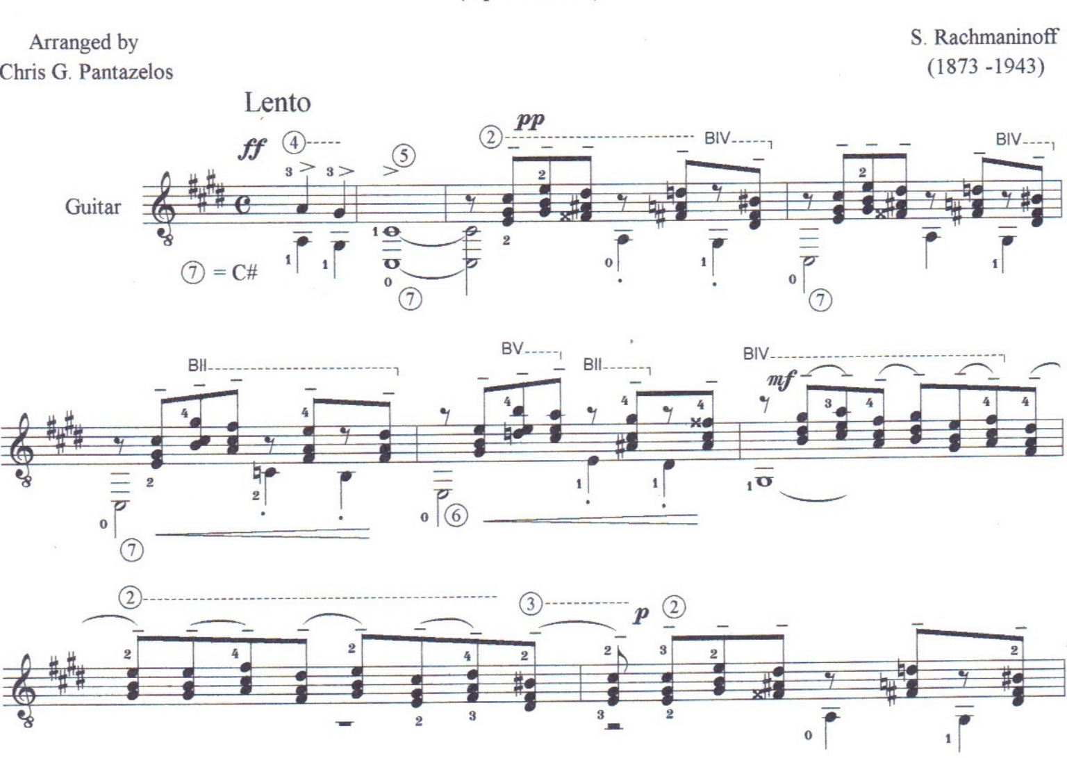
(Op. 3. No. 2)