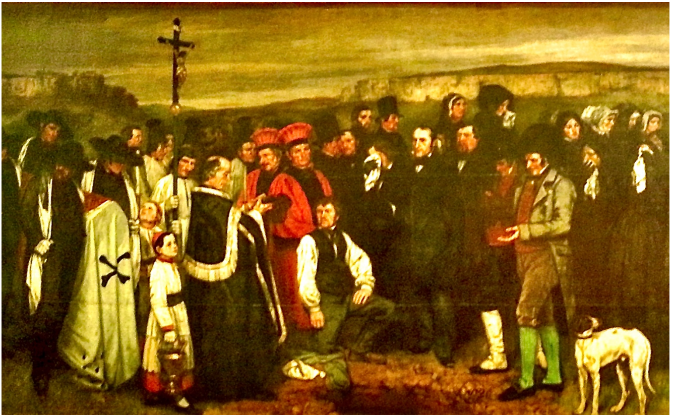
Un enterrement à Ornans Gustave Courbet (1819-1877)