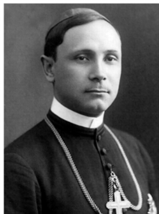
+ IULIU HOSSU