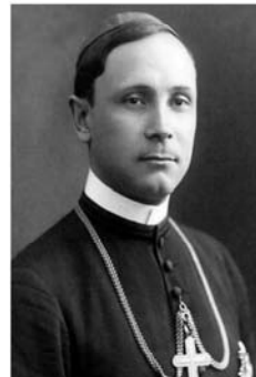
+ IULIU HOSSU

Copyright © 2023 by Serban Nichifor (SABAM and UCMR-ADA)