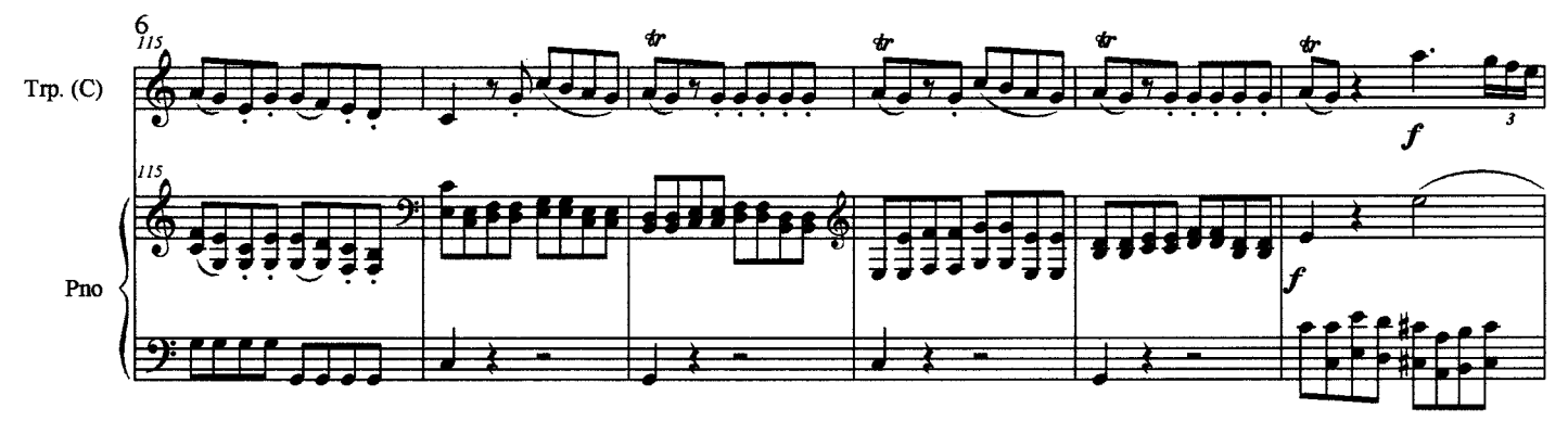
Serenade in G. Eine kleine Nachtmusik KV 525