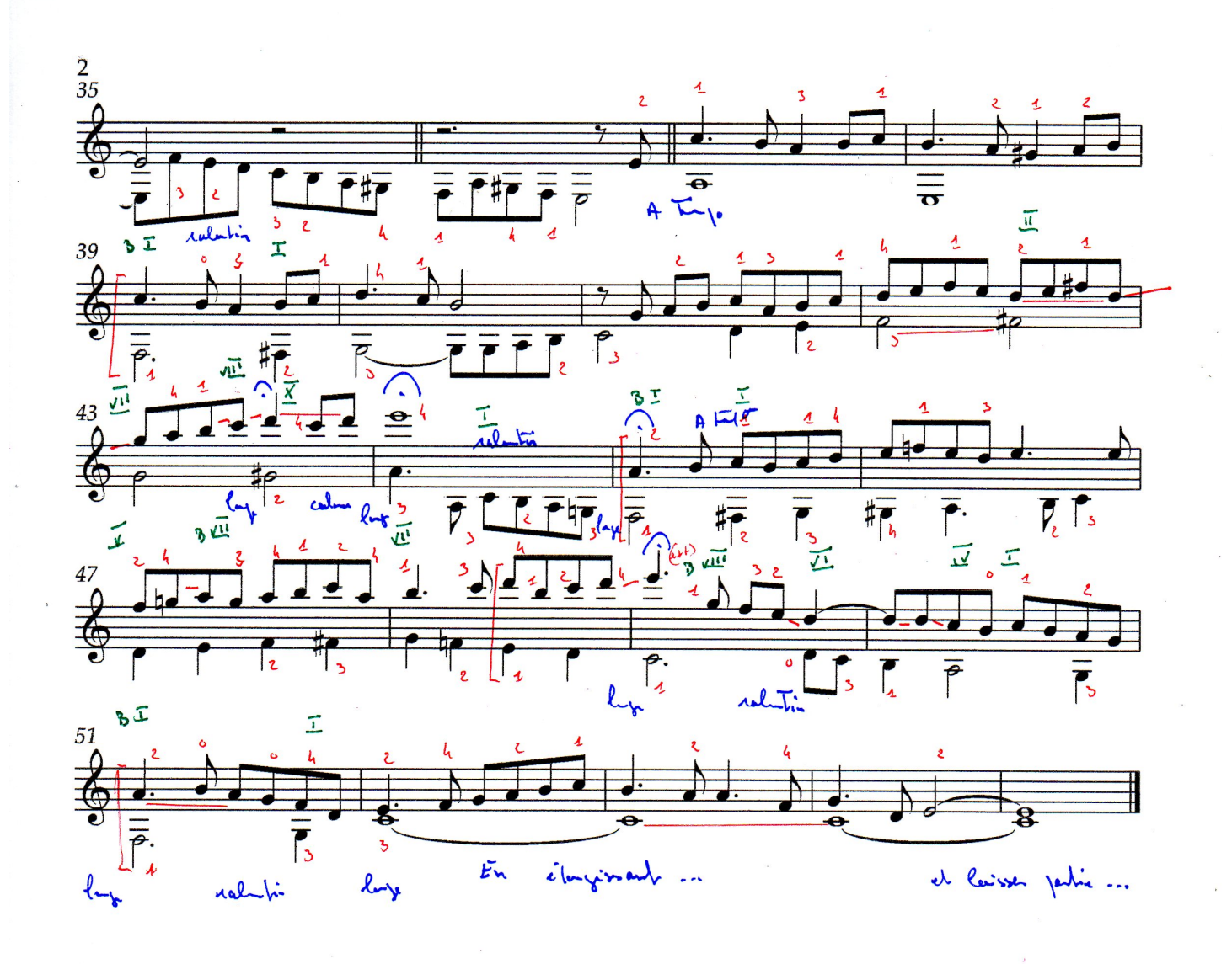
Pièce n° 1778 : "Indubitablement" - p 02 -