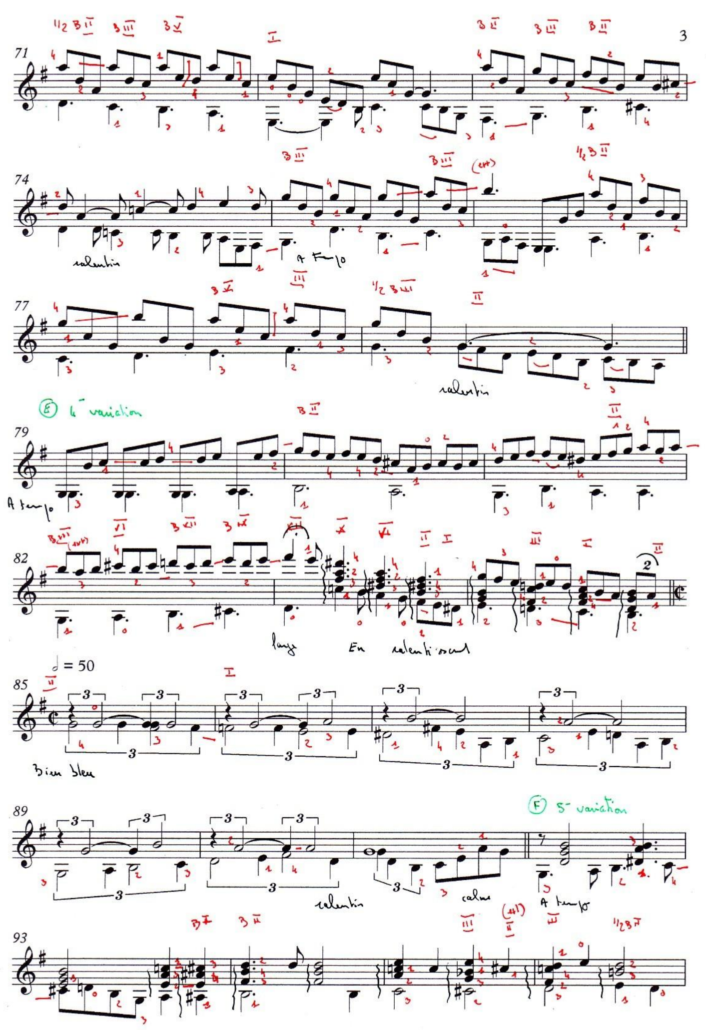
N° 15 - Au clair de la lune - p 03 - free-scores.com