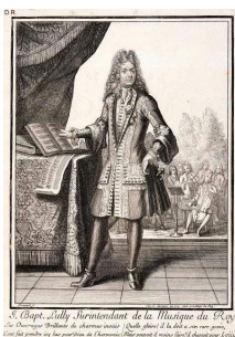
J. Bapt. Lully, Surintendant de la Musique du Roy Le Roy Louis le Grand, de France, par son ordre, a fait faire par son graveur Louis de la Roche un bon portrait de Lully, pour le faire servir à l'usage de l'Académie de France.