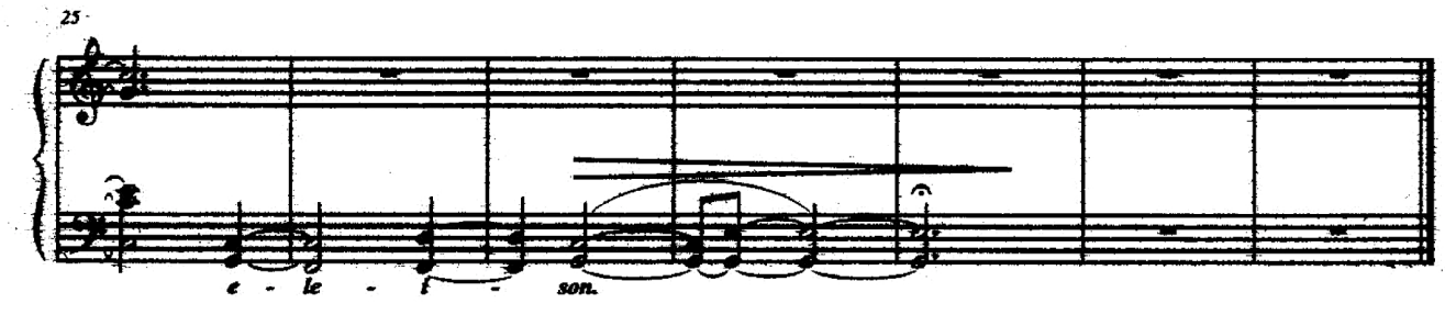
LANGUAGE OPTIONS: Where the vernacular is required, all parts except the Bass are sung in English. The Bass part is still the condensed Greek shown below the Bass notes. free-scores.com