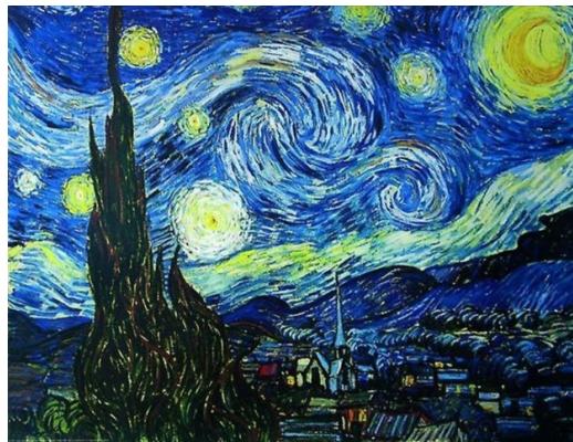
Paysage d'état d'âme