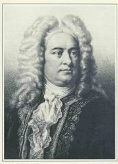
HVW 8 (1712)