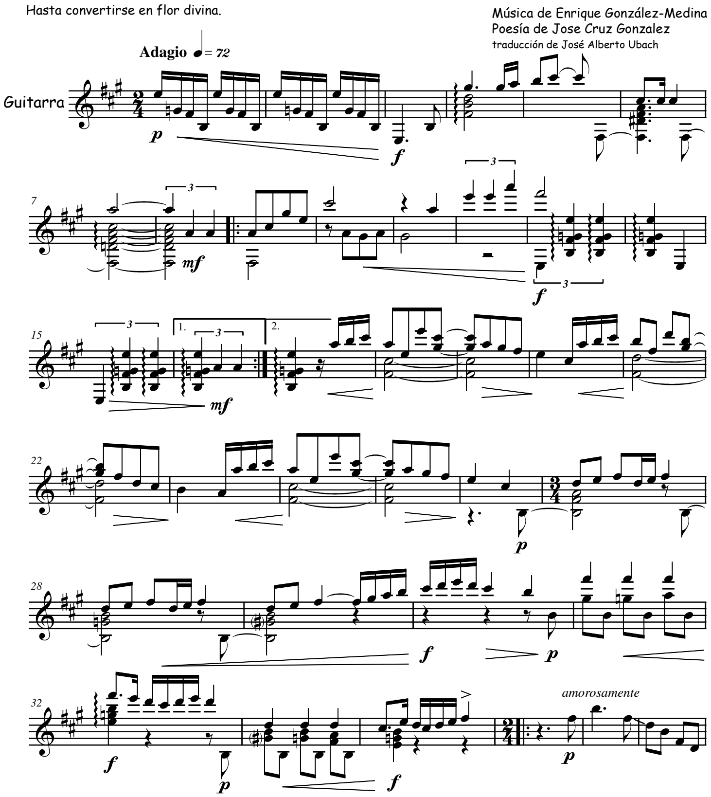
1. El jardinero

Se le cobija con tiernas palabras Y se le ve crecer