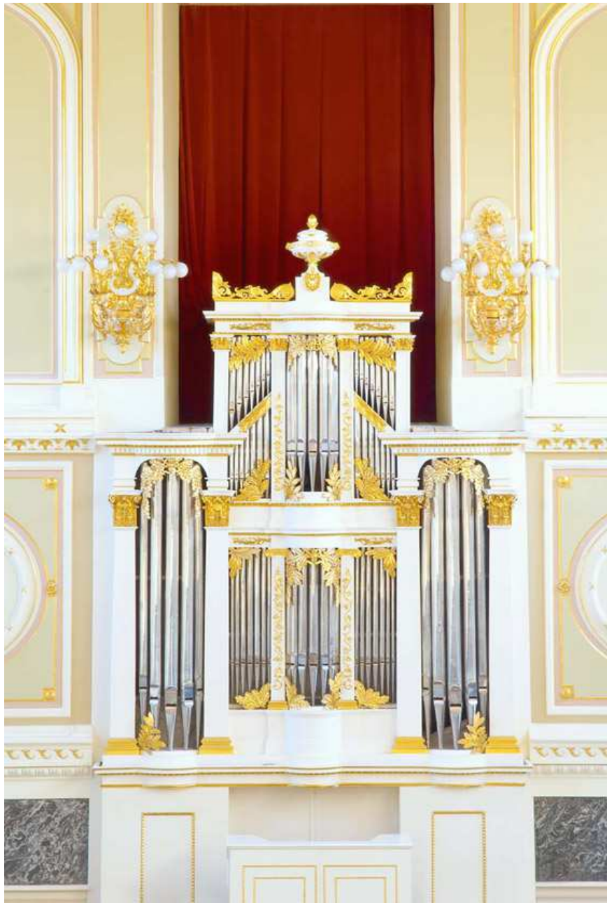
Case of the Walcker organ (Op.604; 1891) in the Hall of the State Glinka Chapel, St.Petersburg