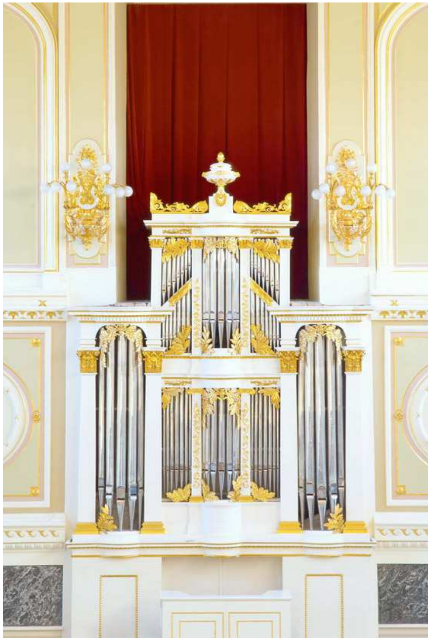
Case of the Walcker organ (Op.604; 1891) in the Hall of the State Glinka Chapel, St.Petersburg