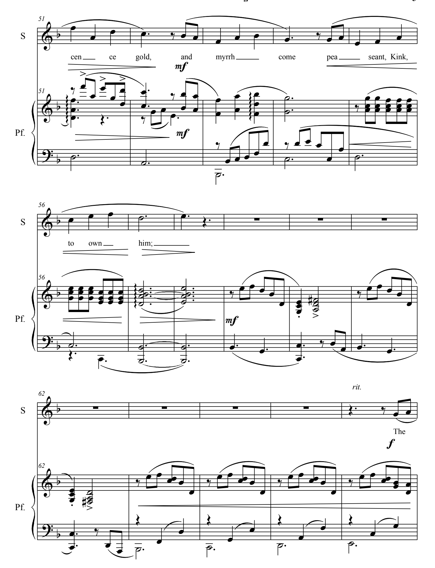
Andrea Ferrante © All rights reserved