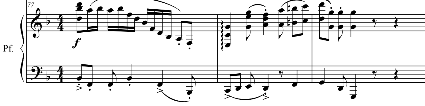
Andrea Ferrante \mathbb C All rights reserved