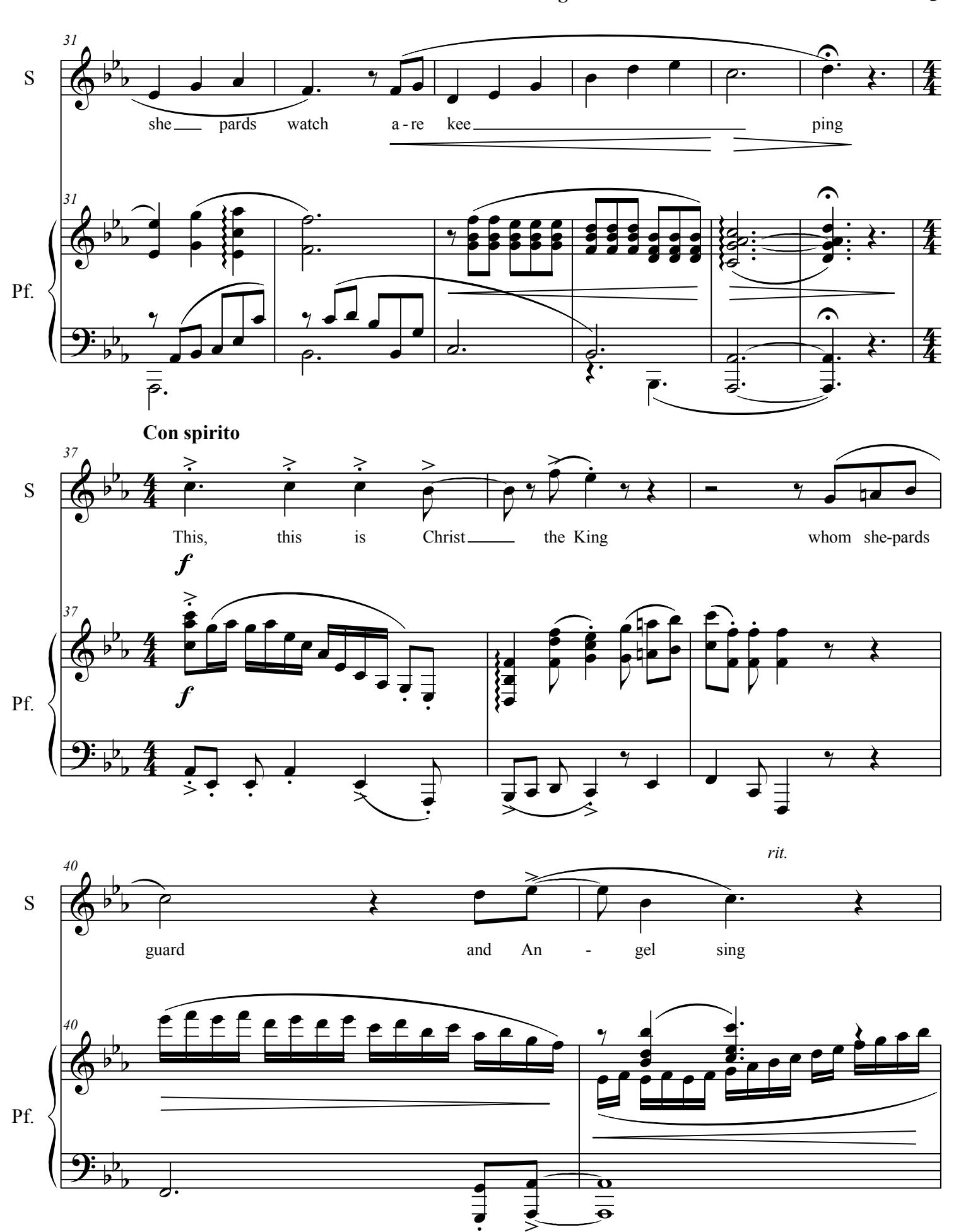
Andrea Ferrante © All rights reserved