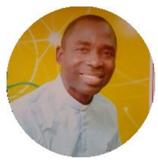
About the piece

Title: Composer: Arranger: Copyright: Publisher: Style: Comment: