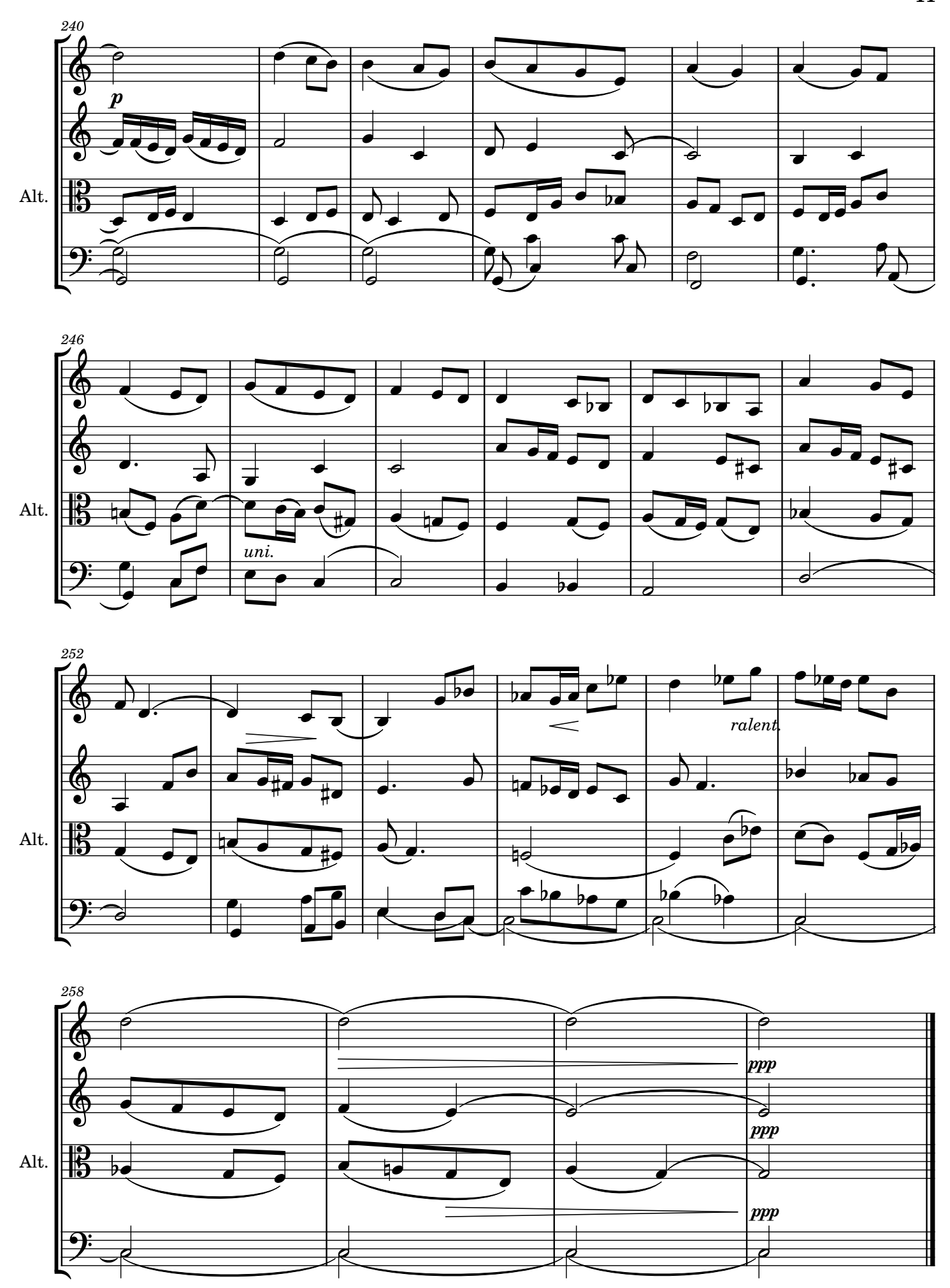
free-scores.com JP DAVEDRAL