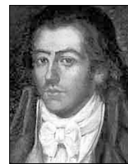
Louis-Claude Daquin 1694-1772