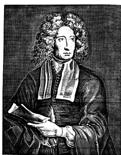
ARCANGELO CORELLI 1653-1713