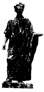
GRANCASSA E PIATTI VENOSA