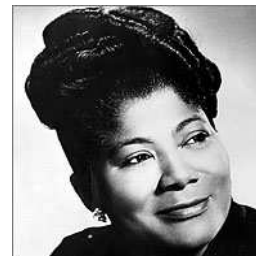
Mahalia Jackson 1911-1972