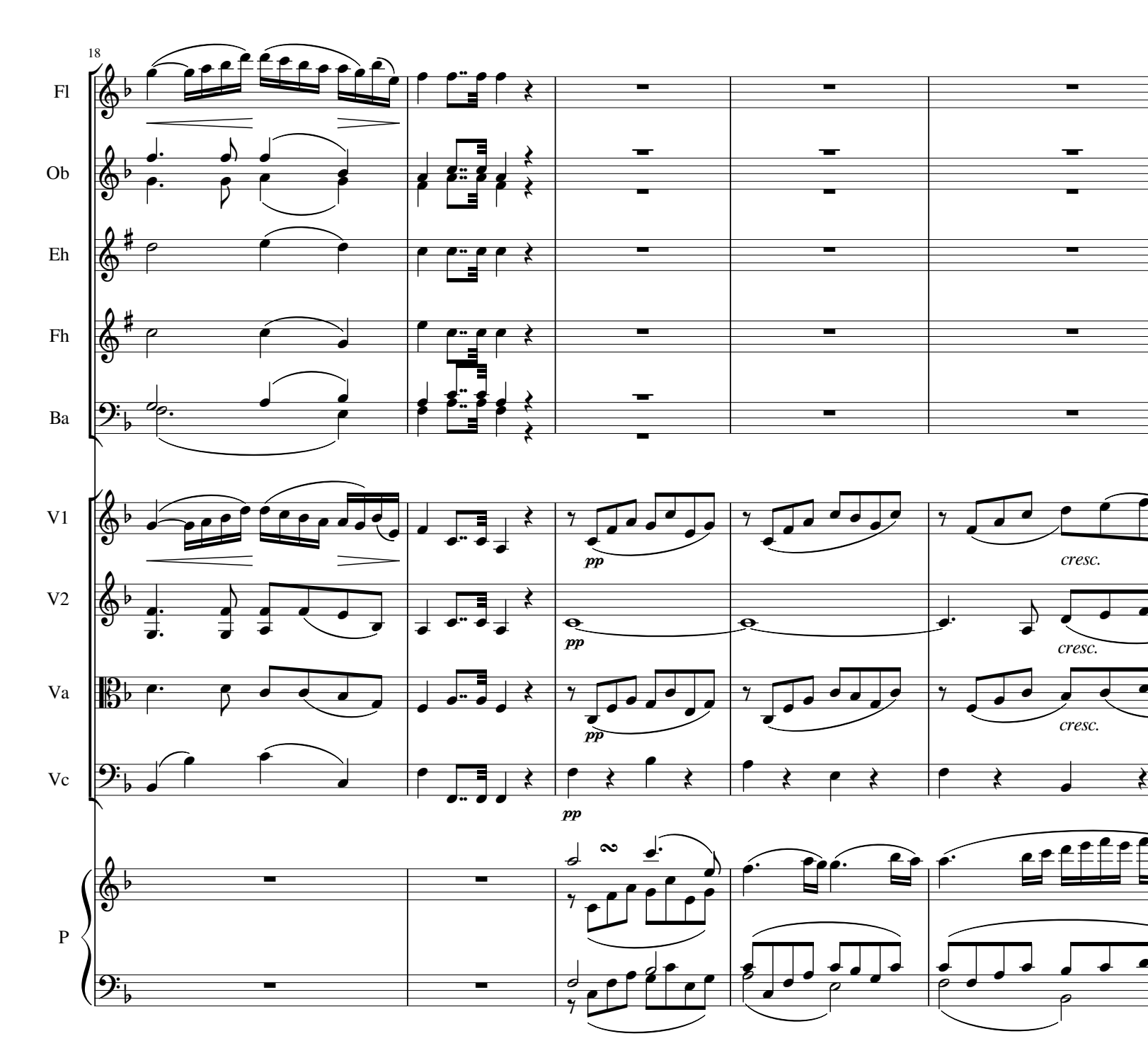
Romance in F Major (Op. 50 No. 2) by Ludwig Van Beethoven Arranged for Small Orchestra by Mike Magatagan (Mike@Magatagan.