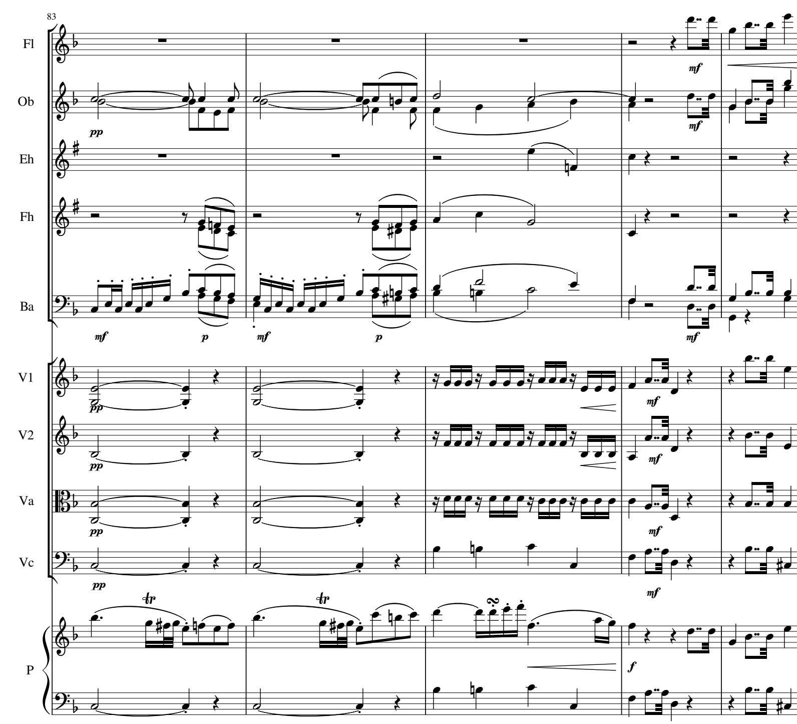
Romance in F Major (Op. 50 No. 2) by Ludwig Van Beethoven Arranged for Small Orchestra by Mike Magatagan (Mike@Magatagan.