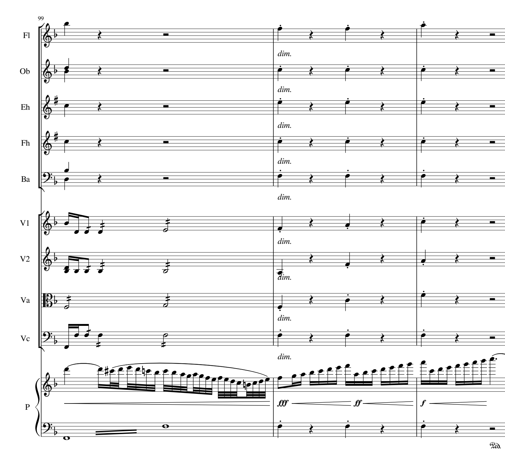
Romance in F Major (Op. 50 No. 2) by Ludwig Van Beethoven Arranged for Small Orchestra by Mike Magatagan (Mike@Magatagan.