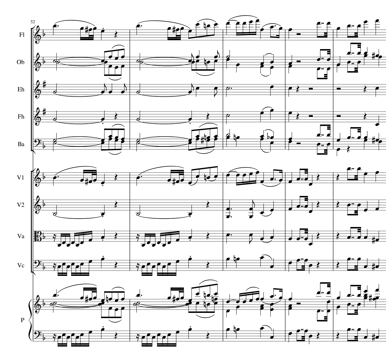
Romance in F Major (Op. 50 No. 2) by Ludwig Van Beethoven Arranged for Small Orchestra by Mike Magatagan (Mike@Magatagan.