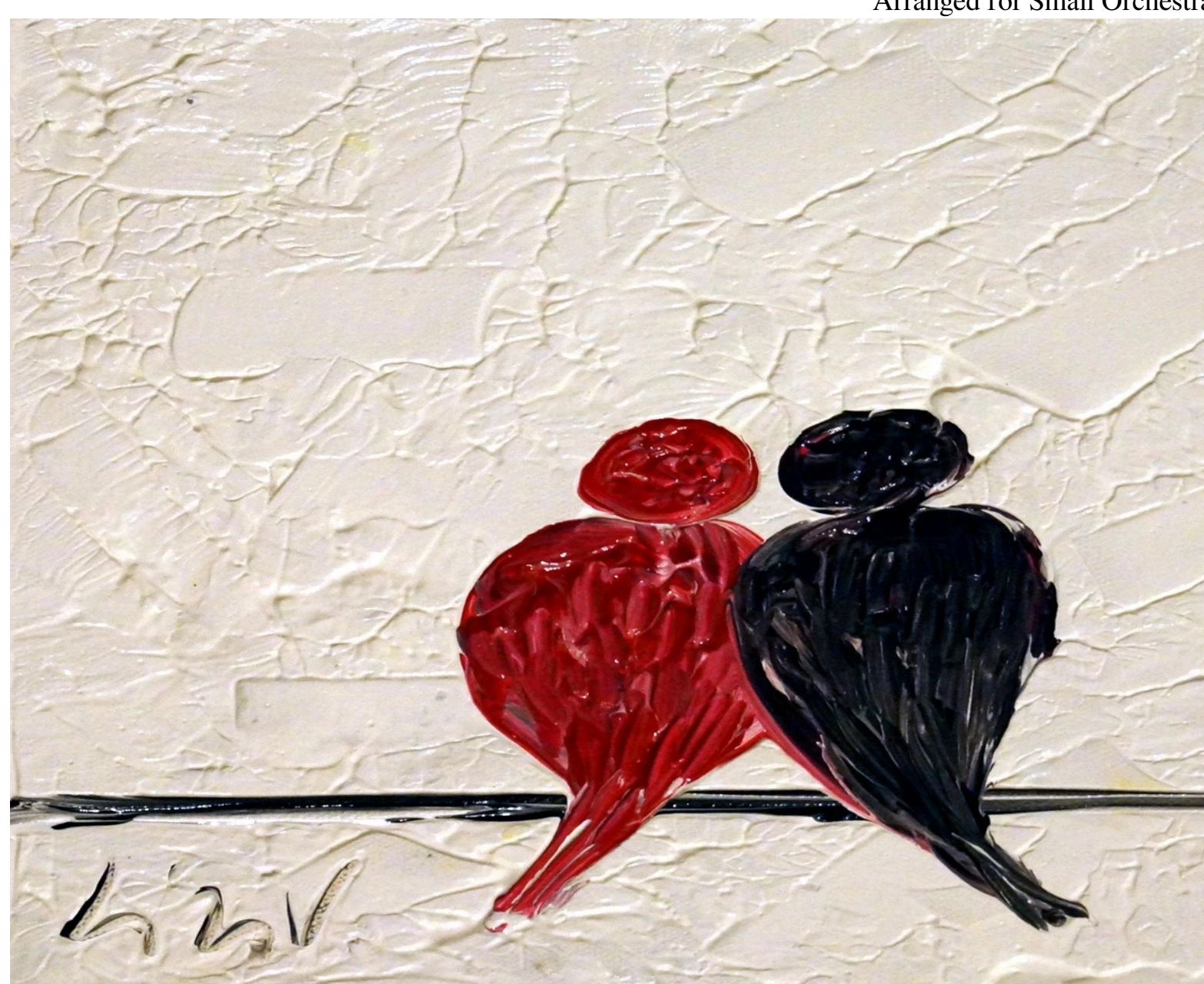
Romance in F Major (Op. 50 No. 2) by Ludwig Van Beethoven Arranged for Small Orchestra by Mike Magatagan (Mike@Magatagan.

Ludwig van Bo Arranged for Small Orchestra