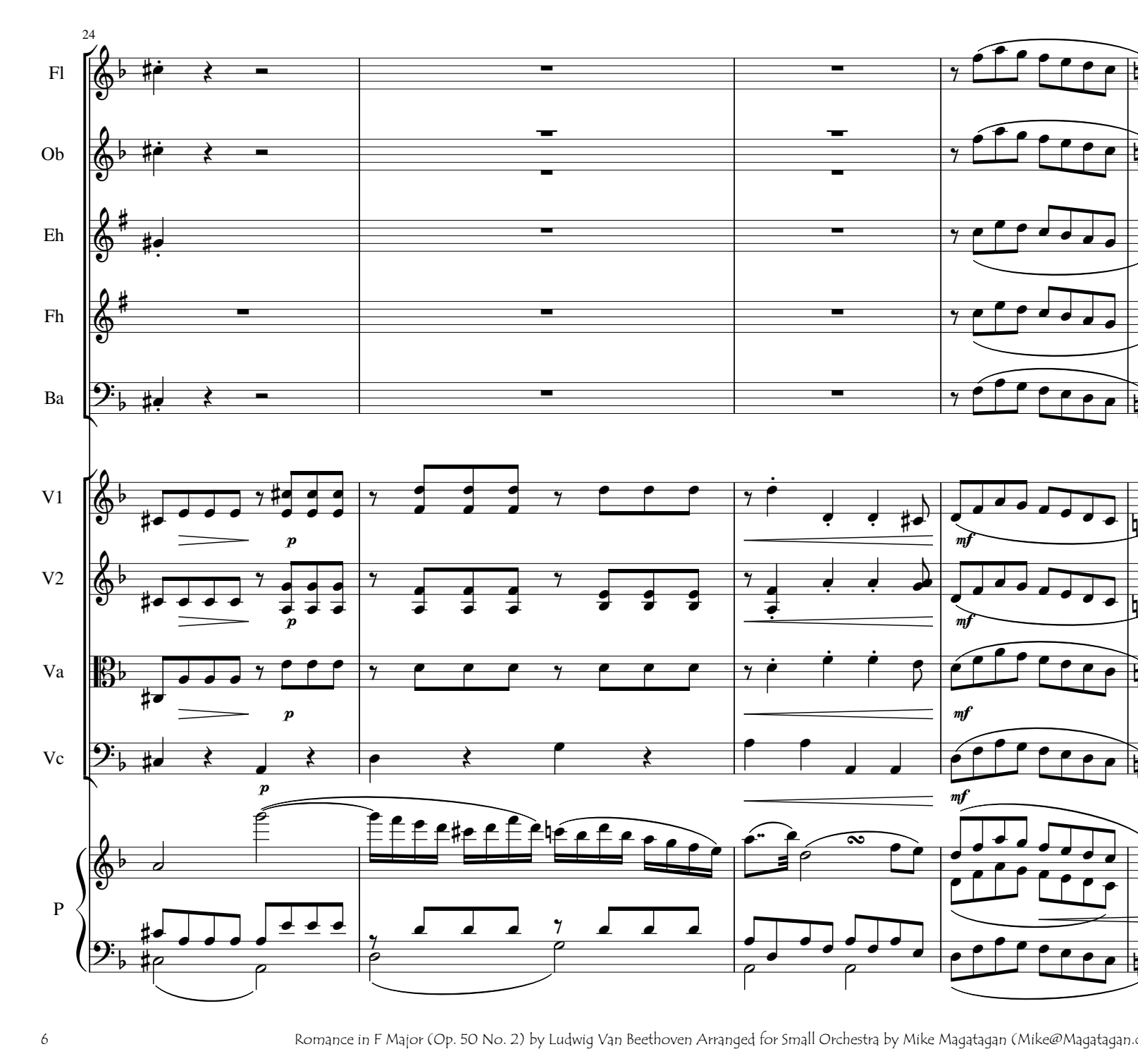
Romance in F Major (Op. 50 No. 2) by Ludwig Van Beethoven Arranged for Small Orchestra by Mike Magatagan (Mike@Magatagan.