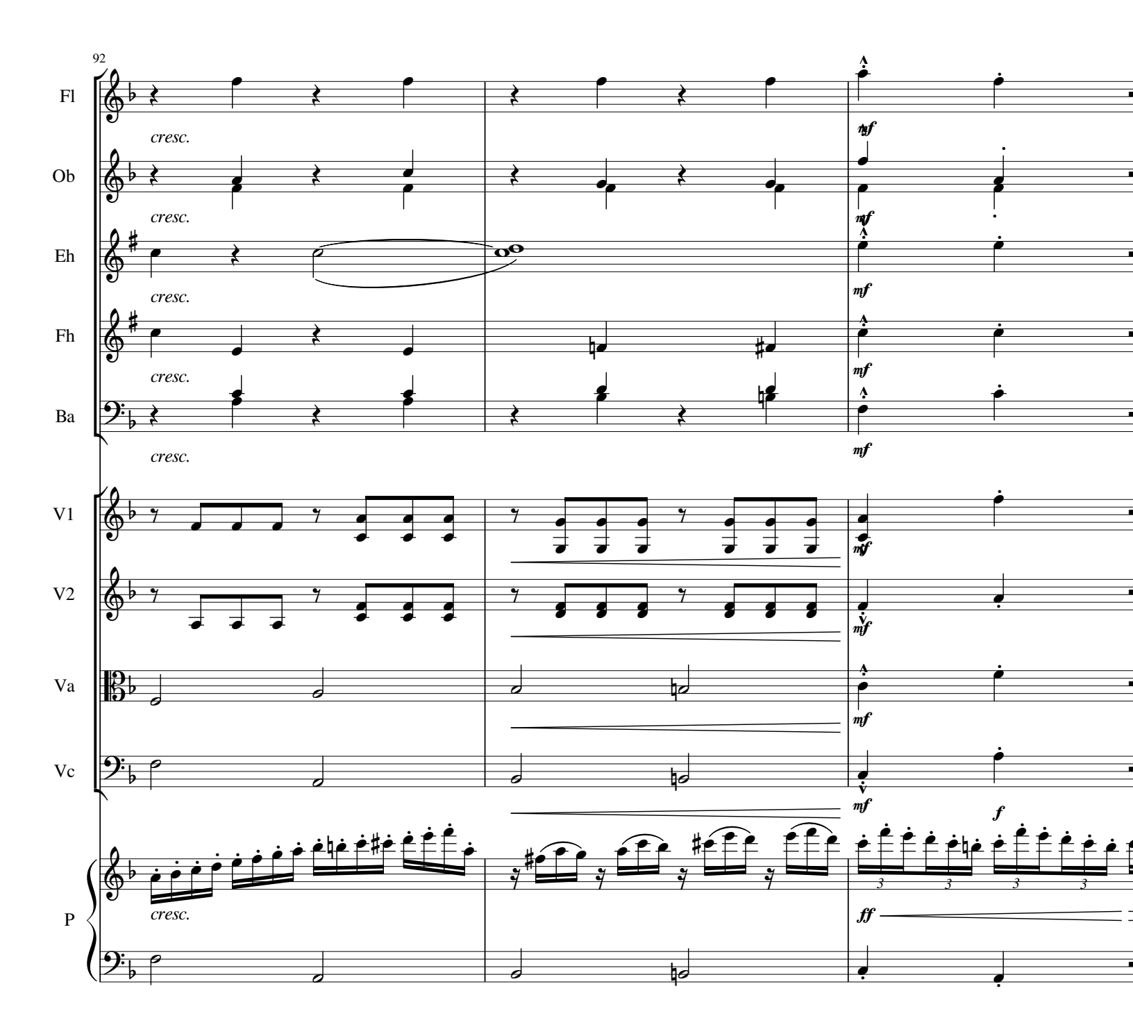
Romance in F Major (Op. 50 No. 2) by Ludwig Van Beethoven Arranged for Small Orchestra by Mike Magatagan (Mike@Magatagan.