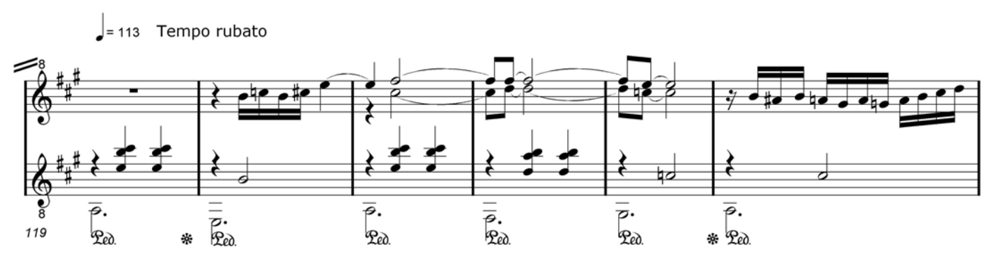
Page 4 - Pièces brèves et valsantes