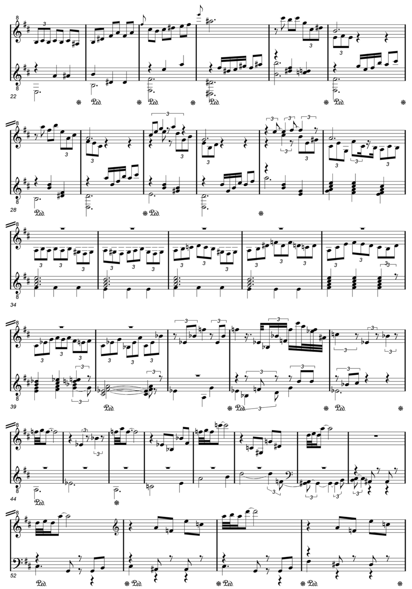
Page 2 - Pièces brèves et valsantes