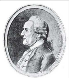
Wilhelm Friedemann Bach