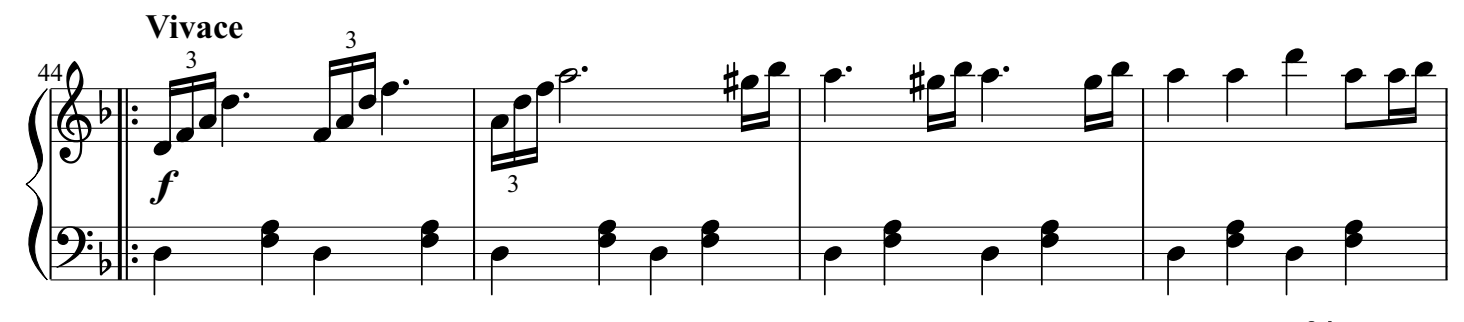
Rep. ad lib. from Sto end