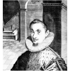
Hans Johann Leo Hassler (1564-1612)