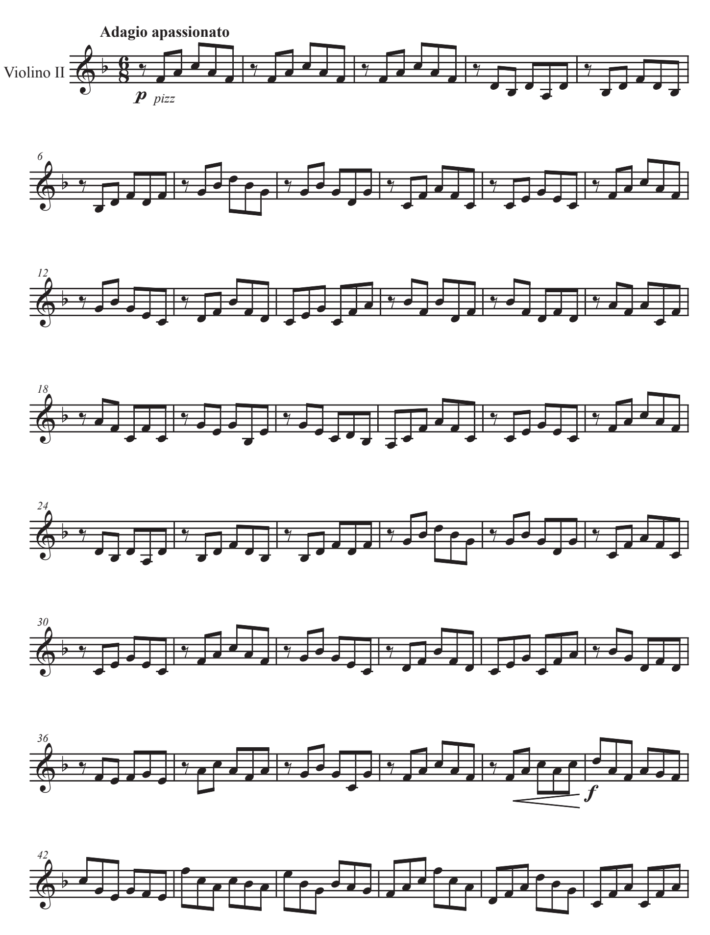
Florent THOMAS © All rights reserved