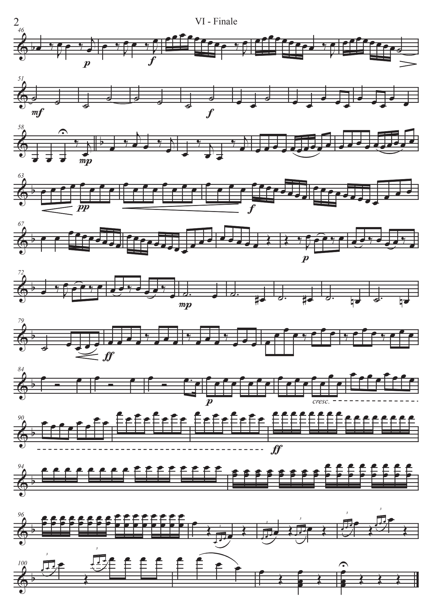
Florent THOMAS © All rights reserved