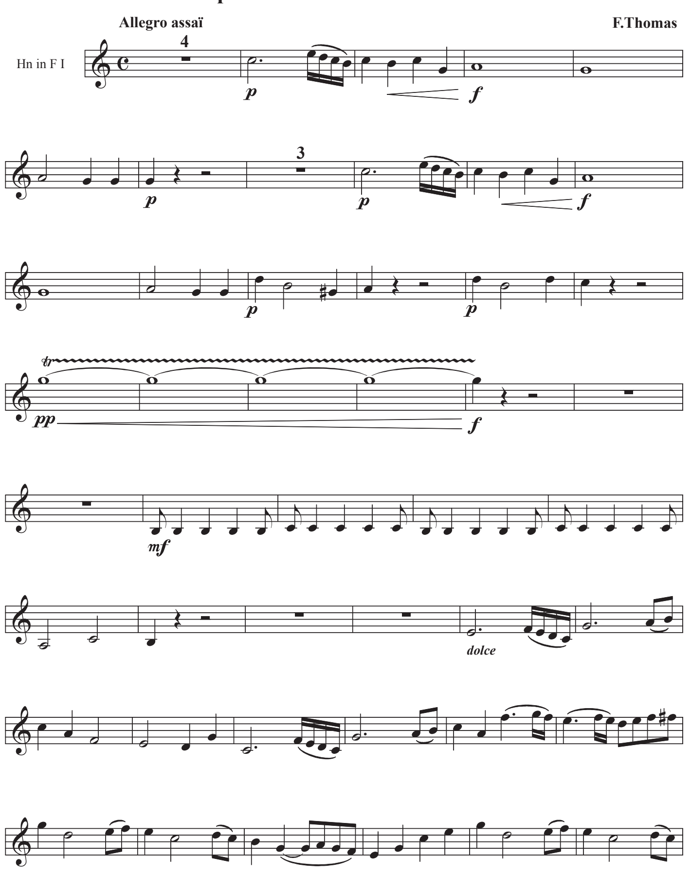
Florent THOMAS © All rights reserved