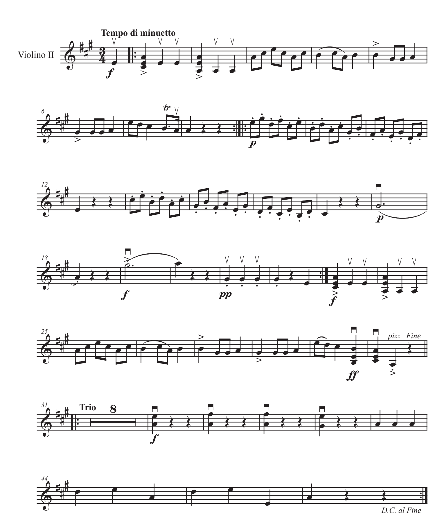
Florent THOMAS © All rights reserved