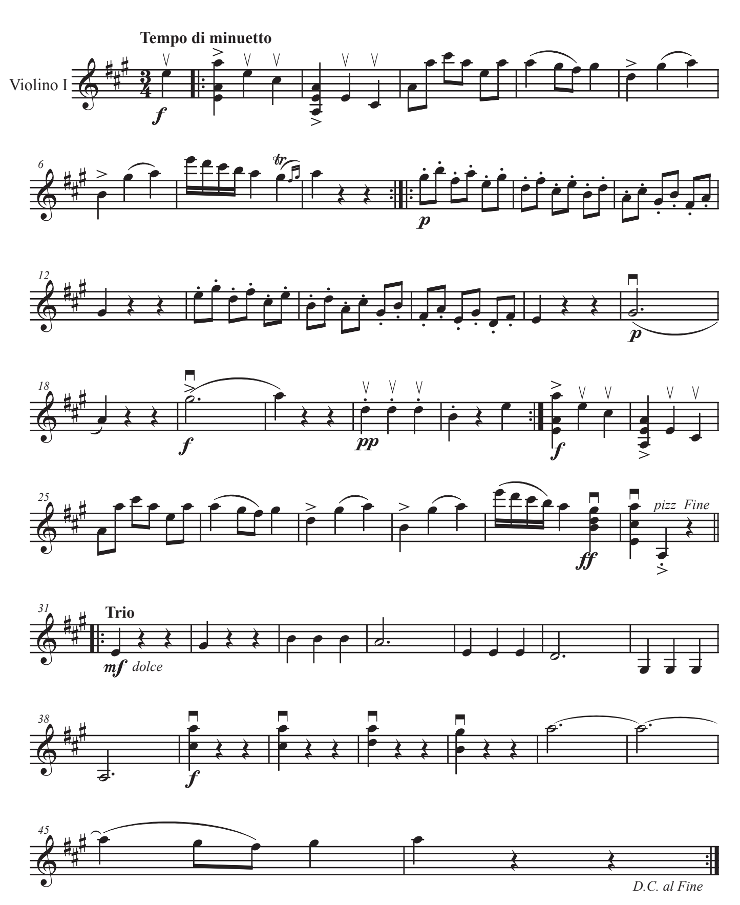
Florent THOMAS © All rights reserved