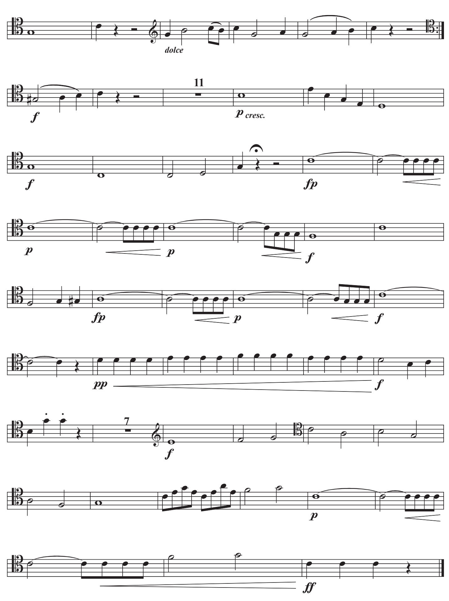
Florent THOMAS © All rights reserved