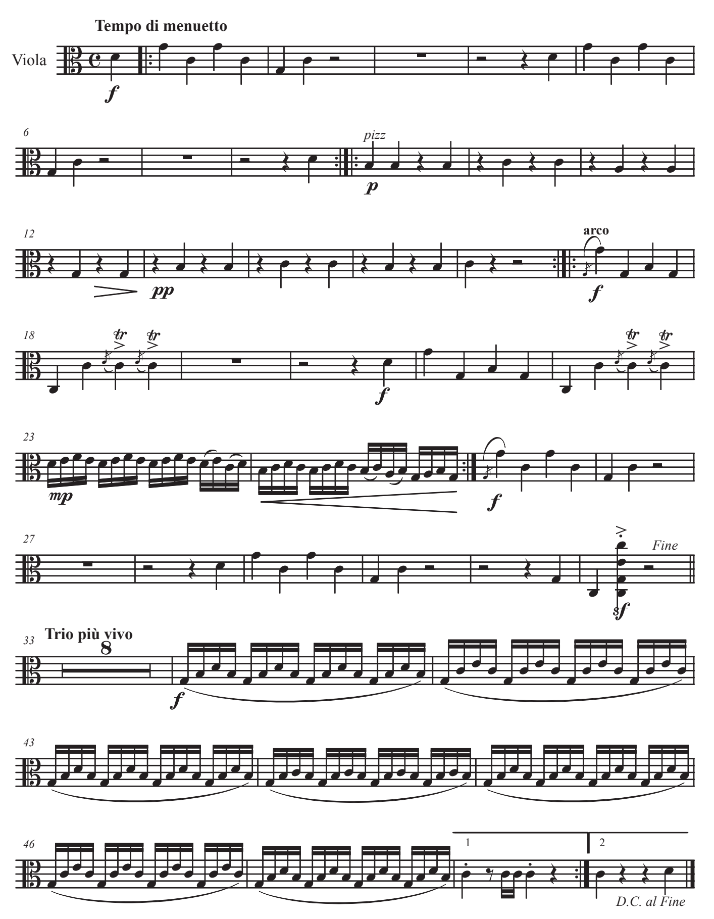
Florent THOMAS © All rights reserved