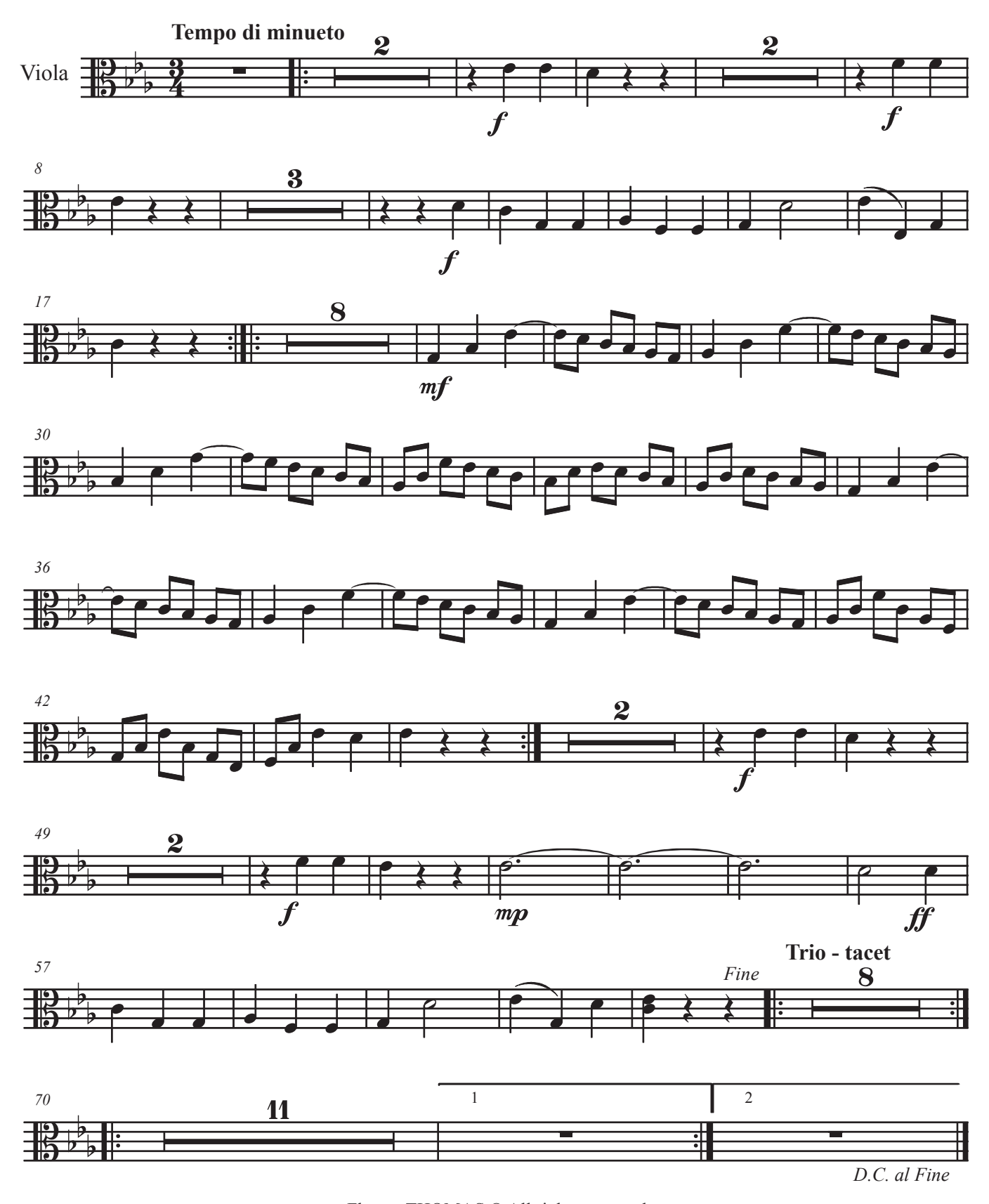
Florent THOMAS © All rights reserved