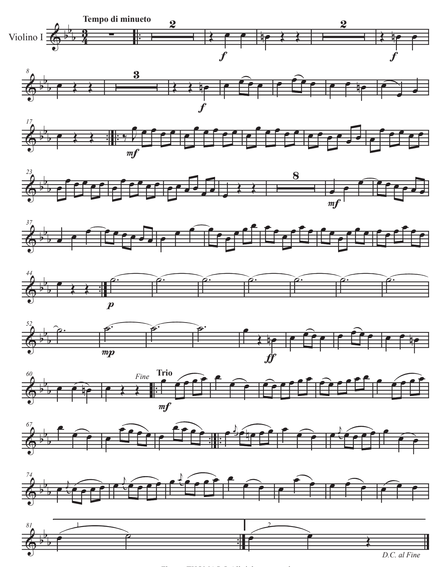
Florent THOMAS © All rights reserved