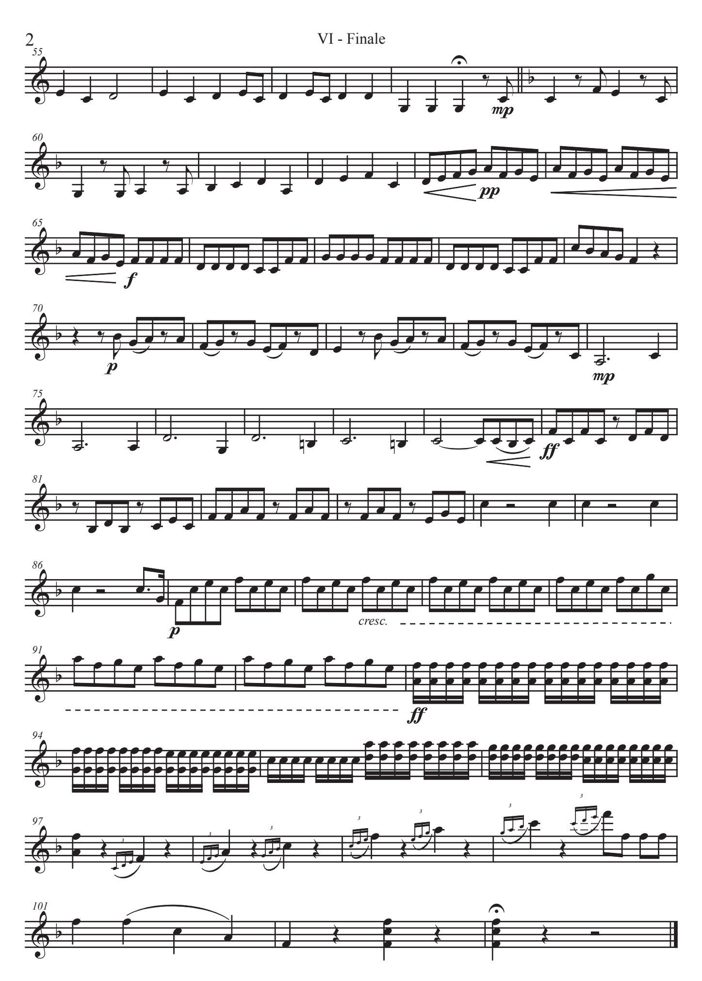
Florent THOMAS © All rights reserved