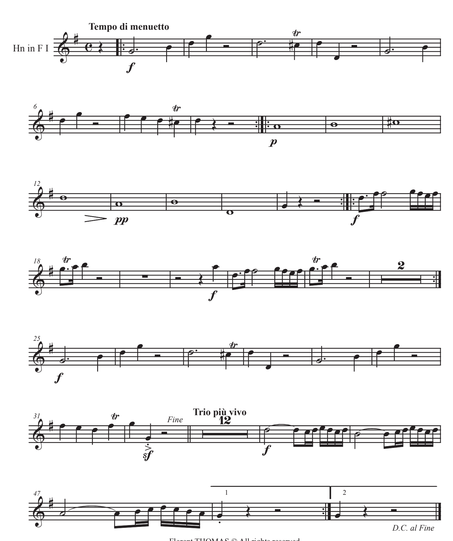
Florent THOMAS {\mathbb C} All rights reserved