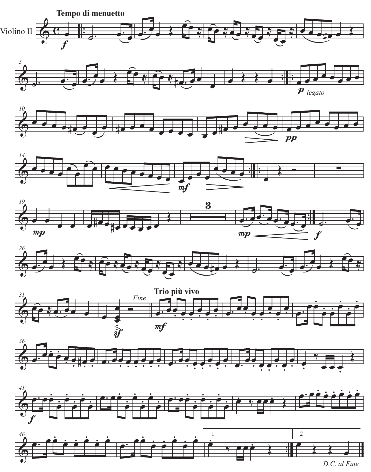
Florent THOMAS © All rights reserved