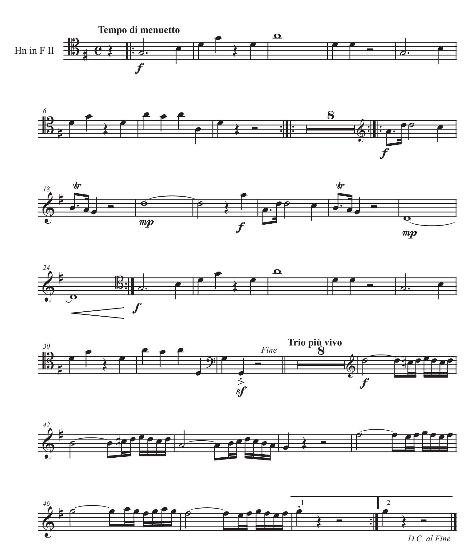
Florent THOMAS © All rights reserved