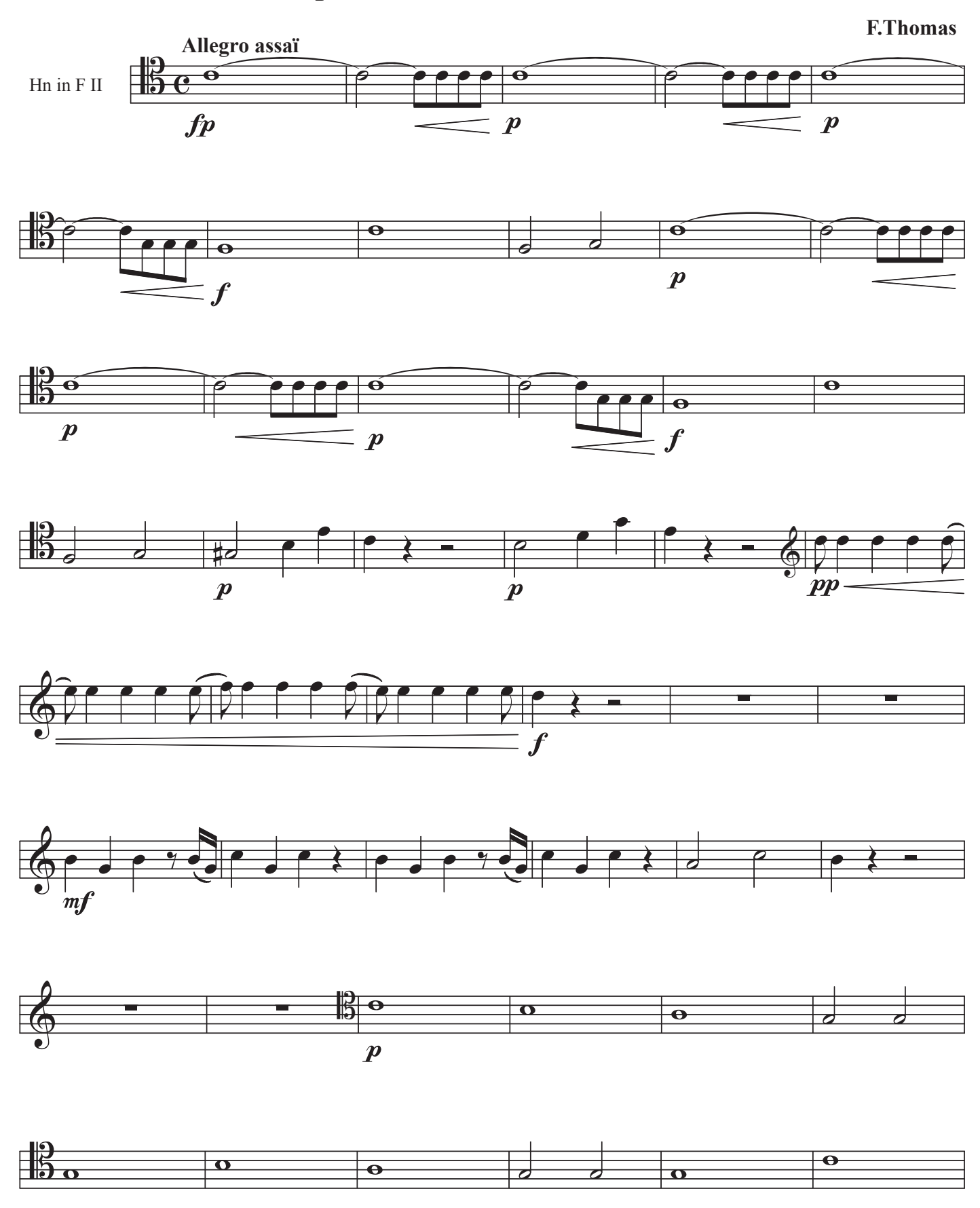
Florent THOMAS © All rights reserved