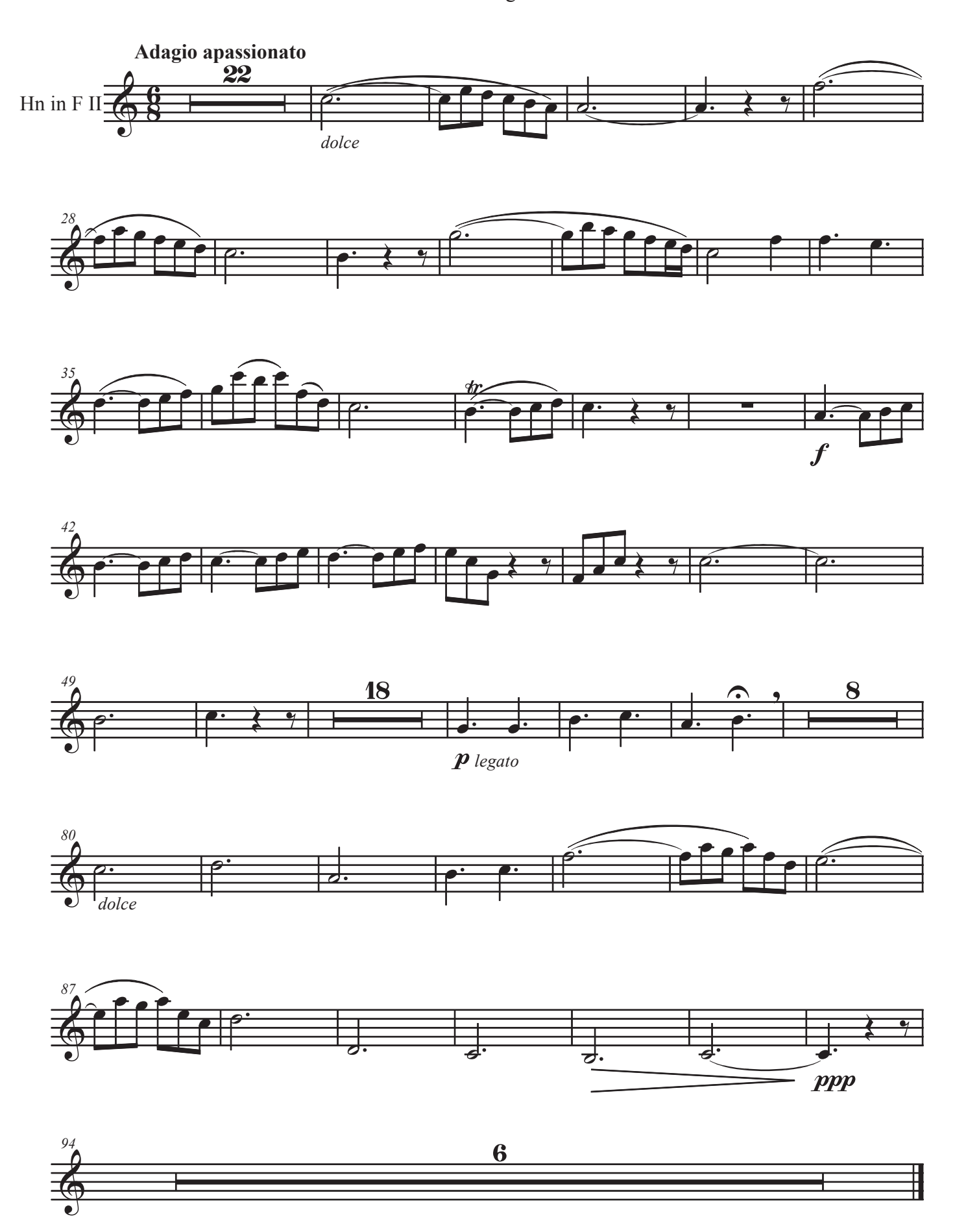
Florent THOMAS © All rights reserved