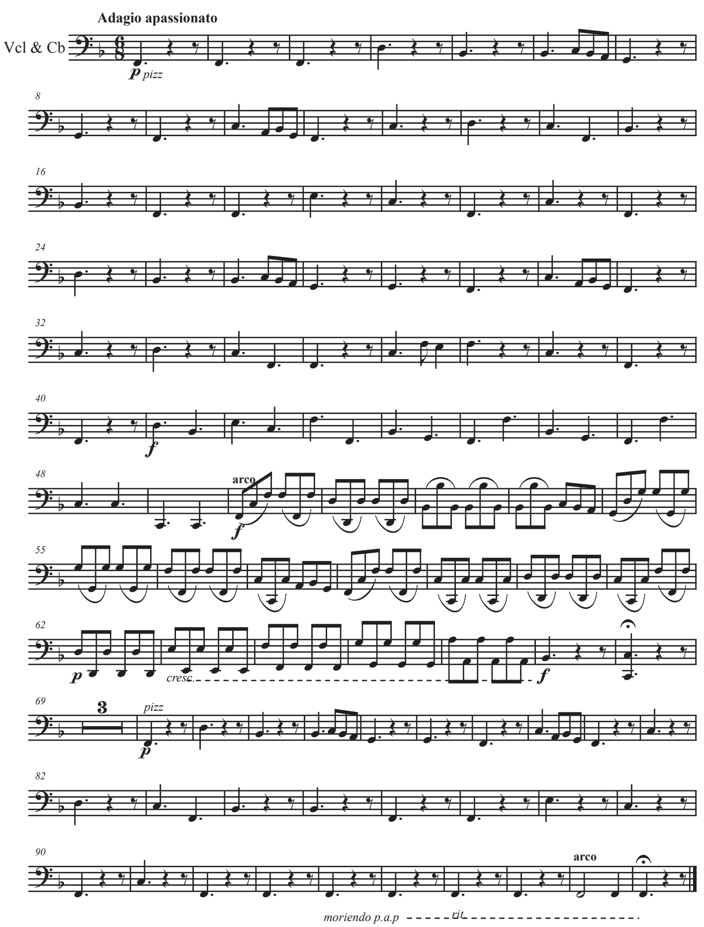
Florent THOMAS {\mathbb C} All rights reserved