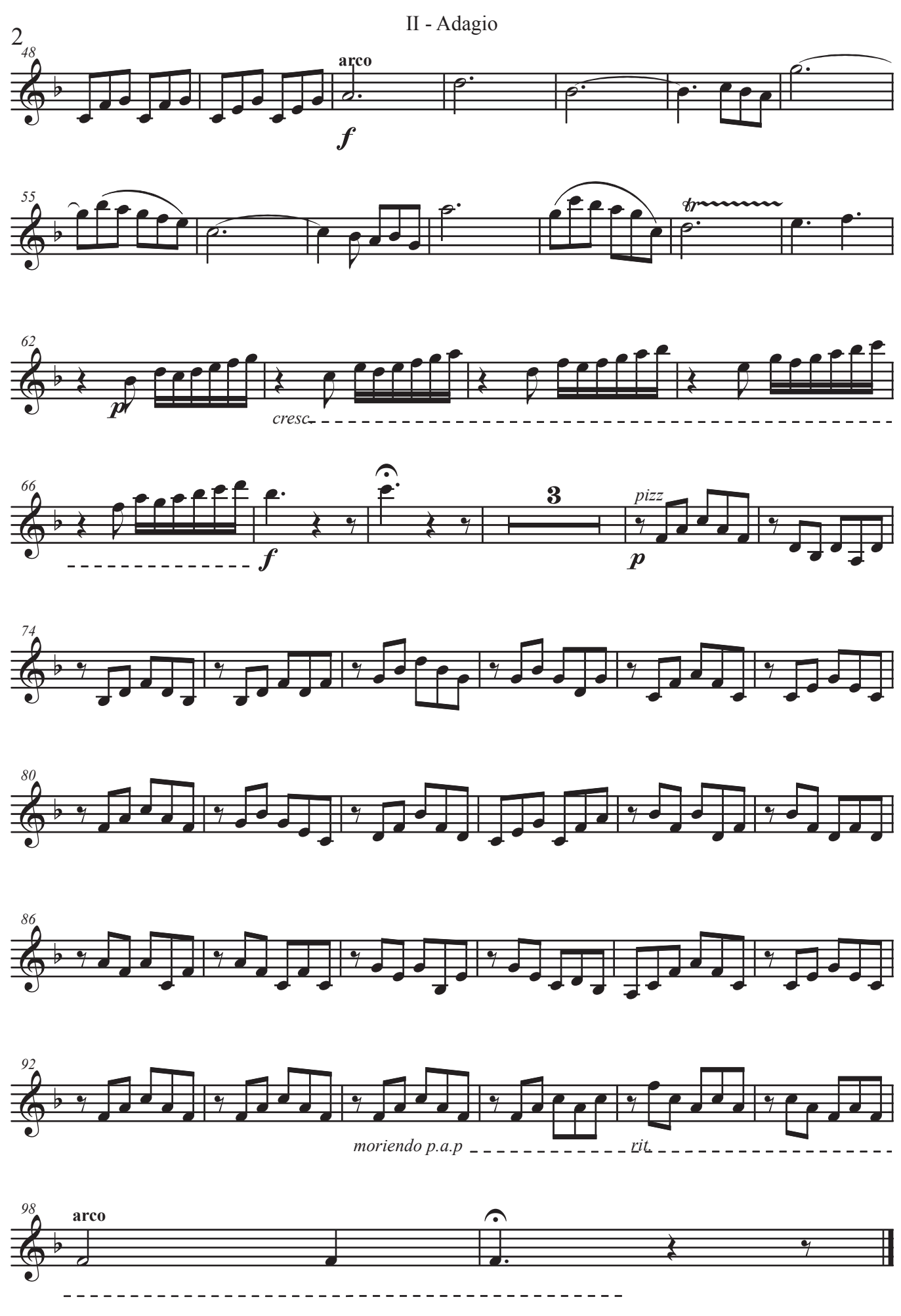
Florent THOMAS © All rights reserved