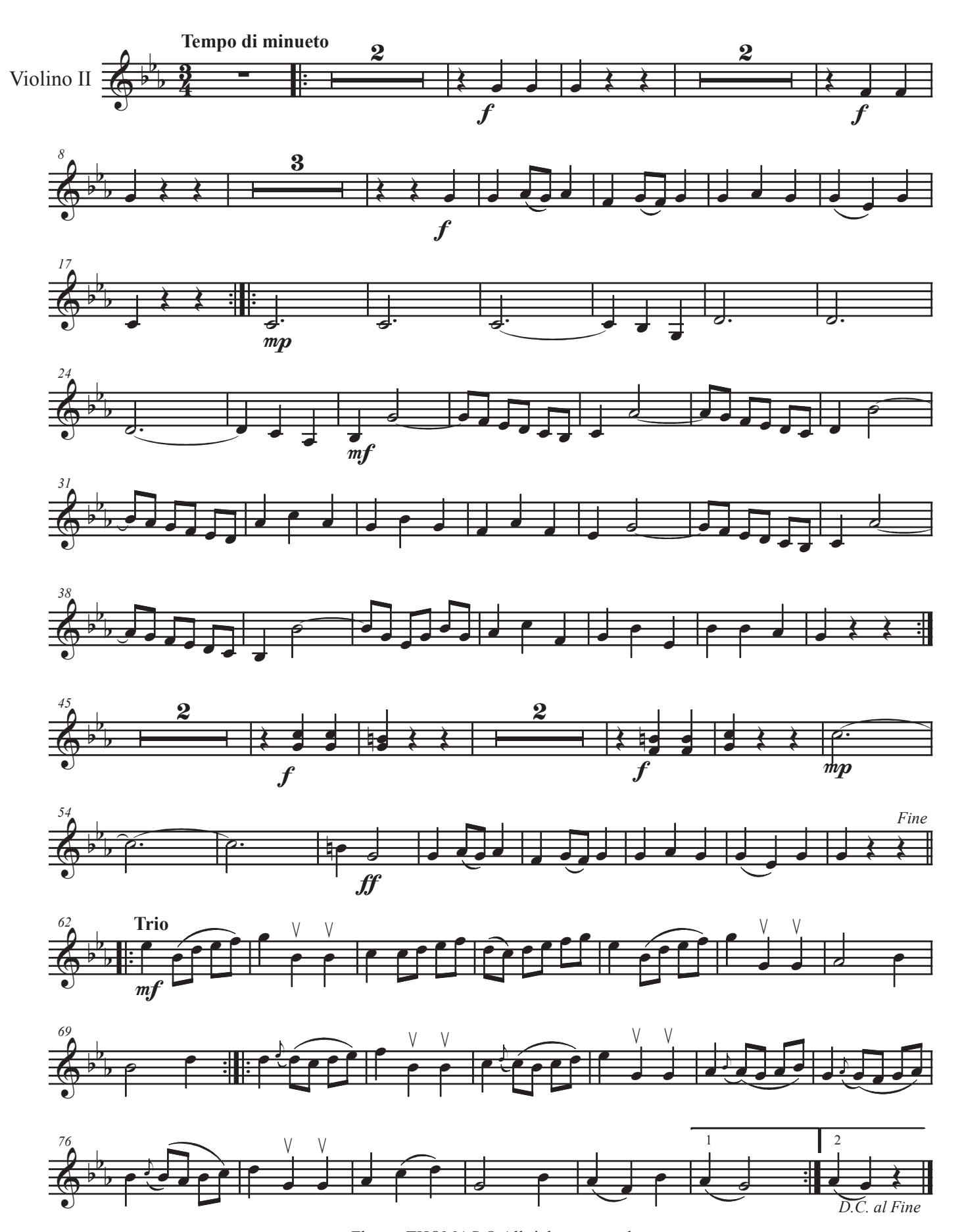
Florent THOMAS © All rights reserved