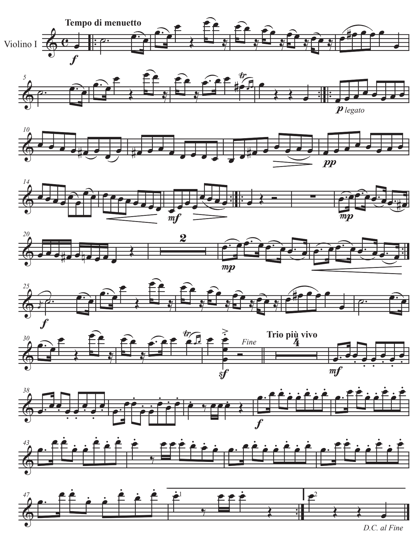
Florent THOMAS © All rights reserved