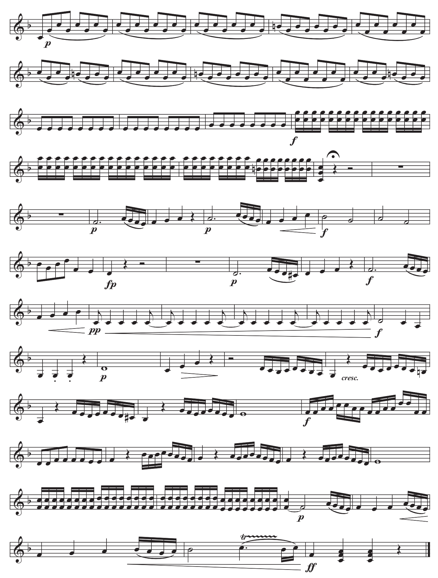
Florent THOMAS © All rights reserved