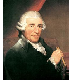
Joseph HAYDN (1732-1809)