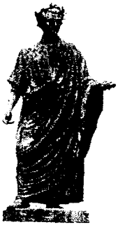
ORATIO FLACCO VENUSIA