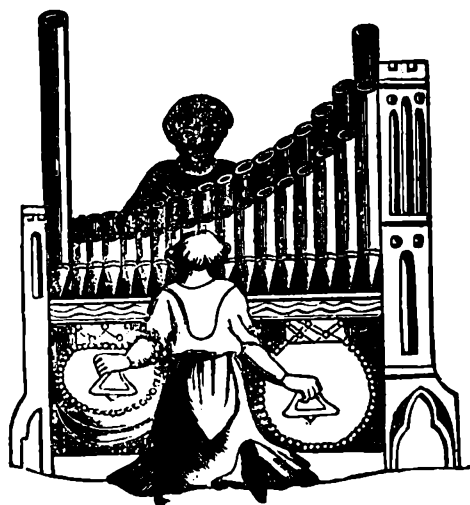
A Keyed Organ of the 16th Century.

(Miniature from a Latin Psalter in the Library at Paris.)