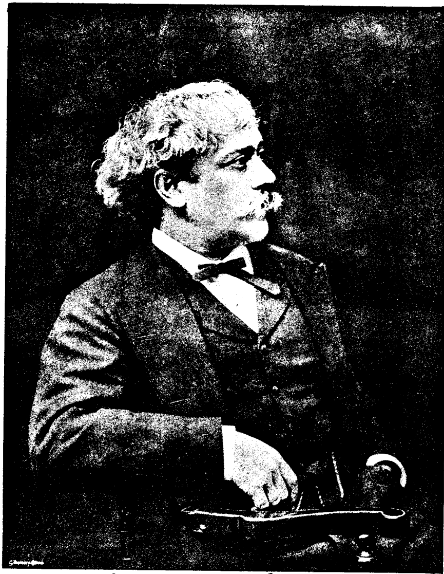
Pablo de Sarasate