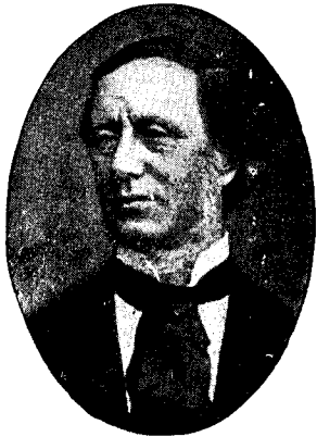
SIR WILLIAM STERNDALE BENNETT. 1816-1875.