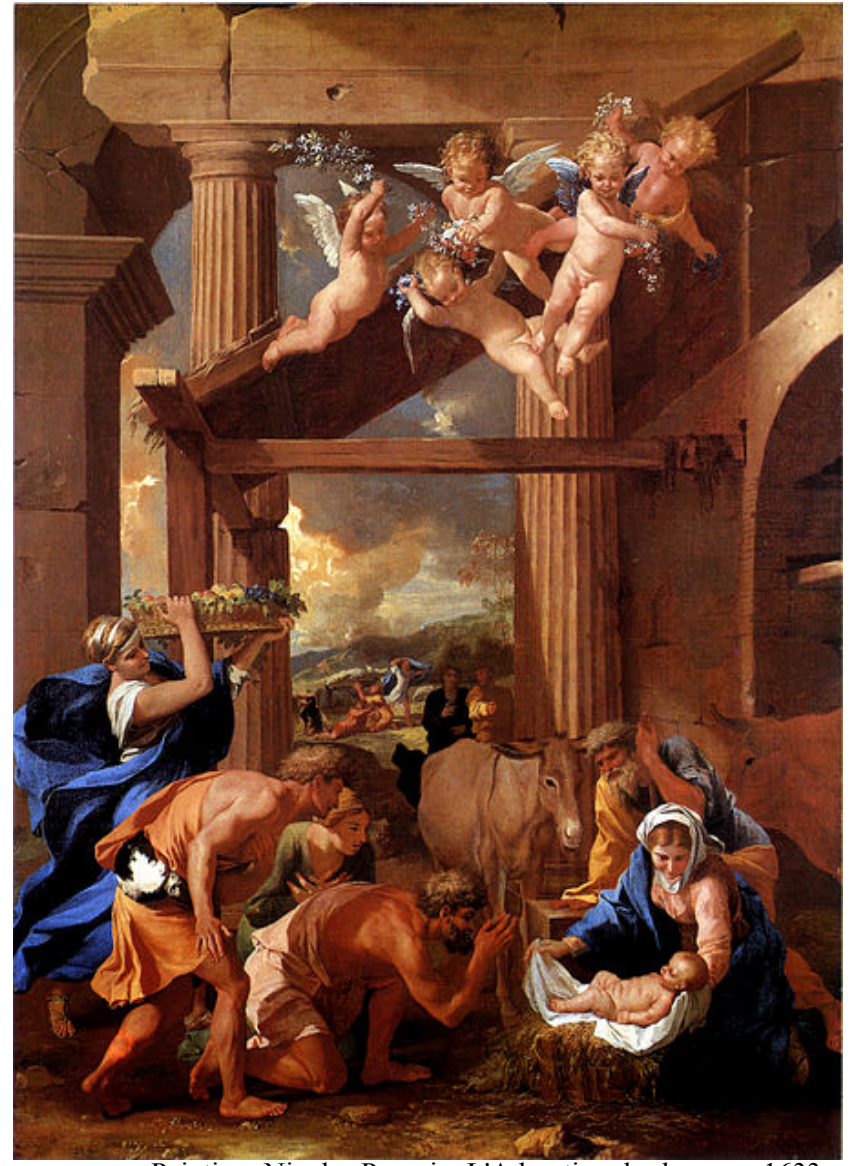
Painting: Nicolas Poussin, L'Adoration des bergers, 1633