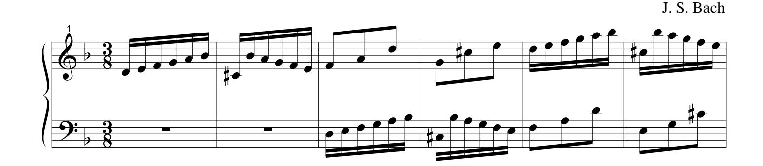
Two-Part Invention No. 4 BWV 775