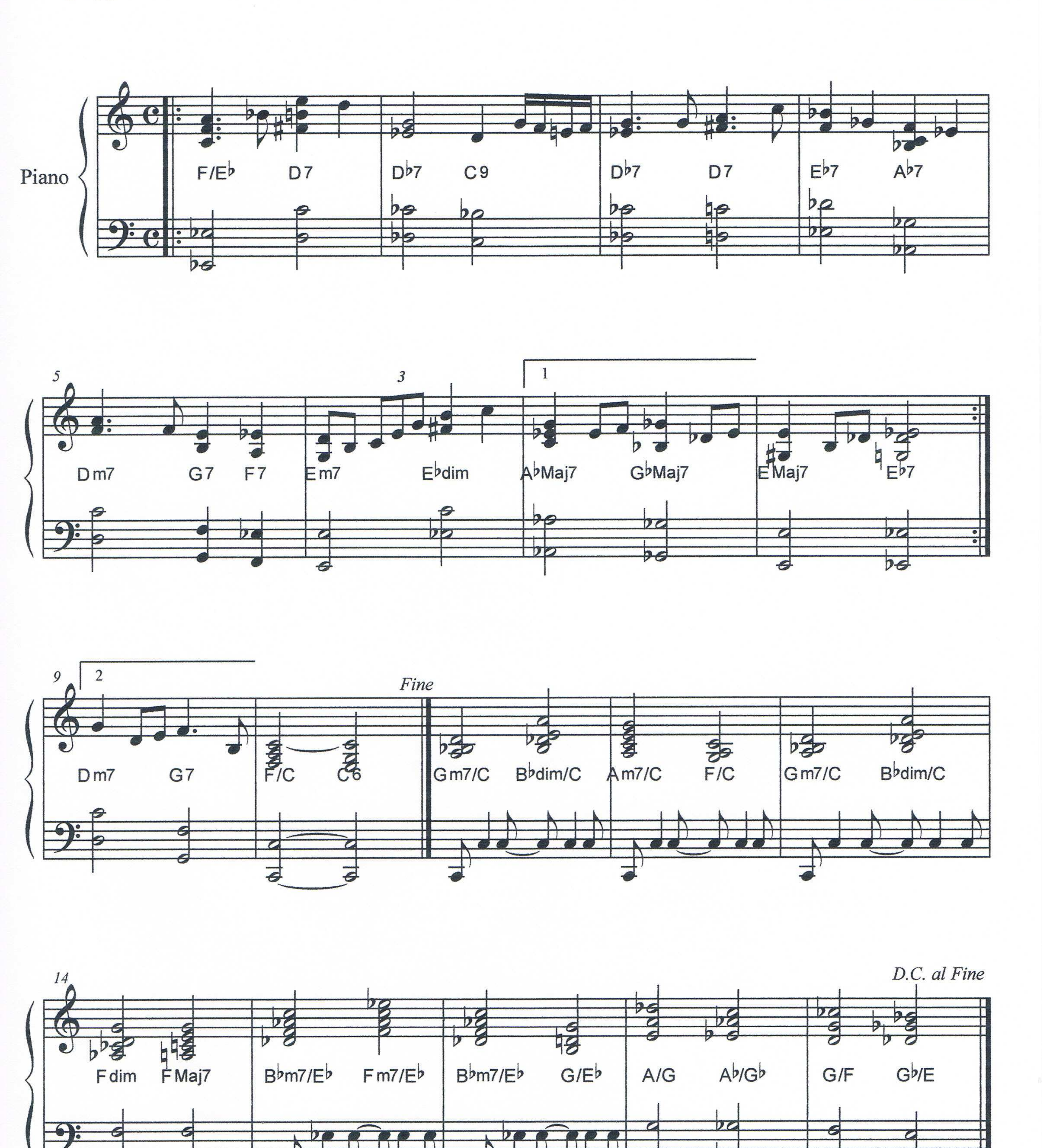
2003 LucyamaMusic @ All rights reserved