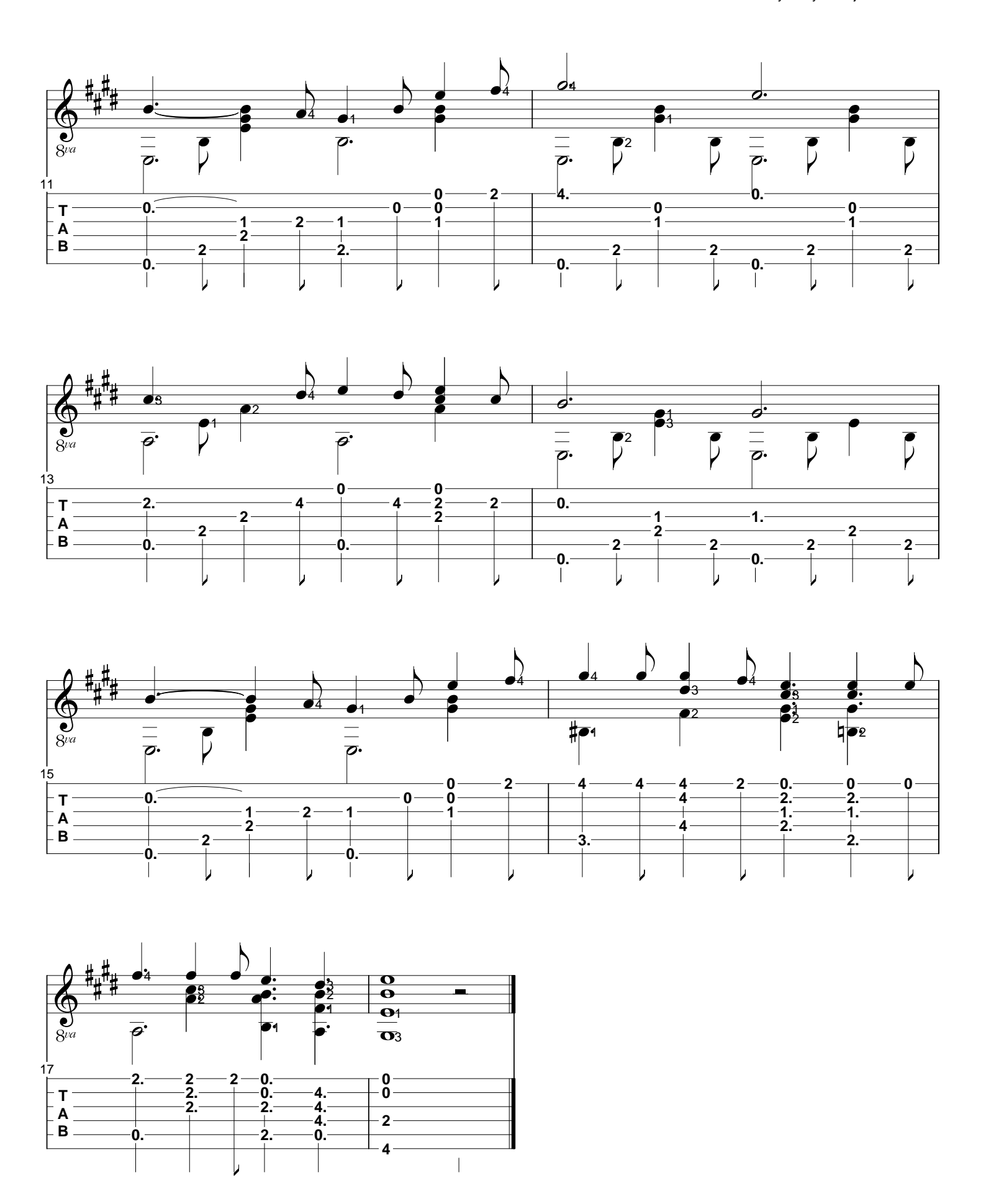
Page 2 / 2