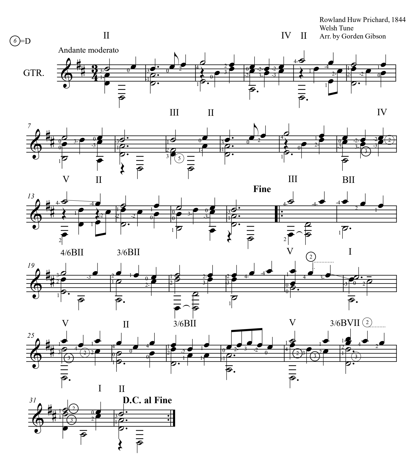
Copyright \ensuremath{\mathbb{C}} May 25, 2020 by Gorden Gibson. All rights reserved.