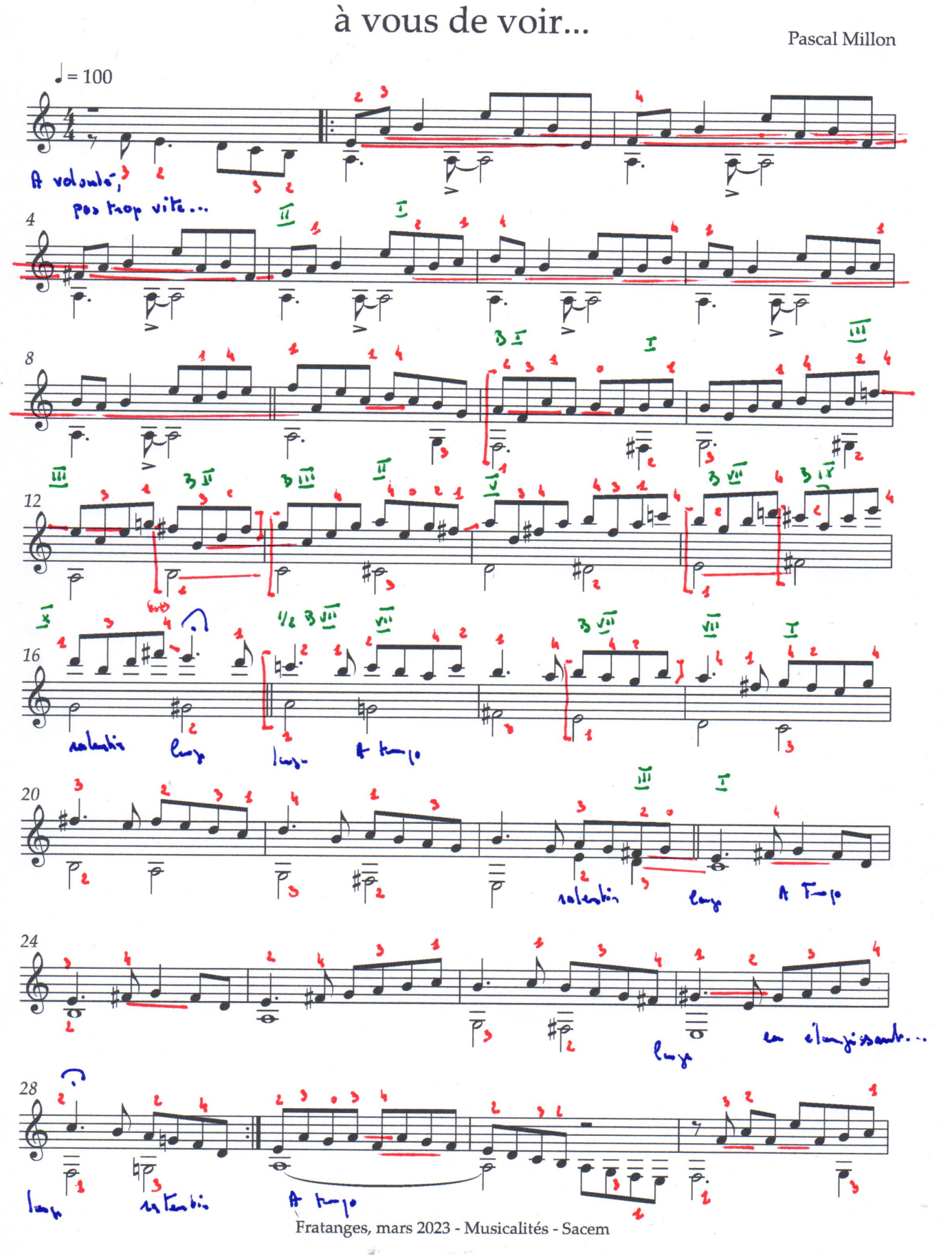
Tôt ou tard?