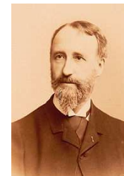
Théodore Dubois 1857-1924

GRAND CHOEUR sans 16 P. et sans Tirasse. Claviers accouplés.