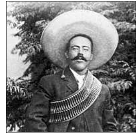
Pancho Villa 1878-1923