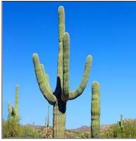
Christian Faivre © 2012