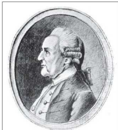
Wilhelm Friedemann Bach